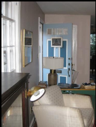
Existing sitting room