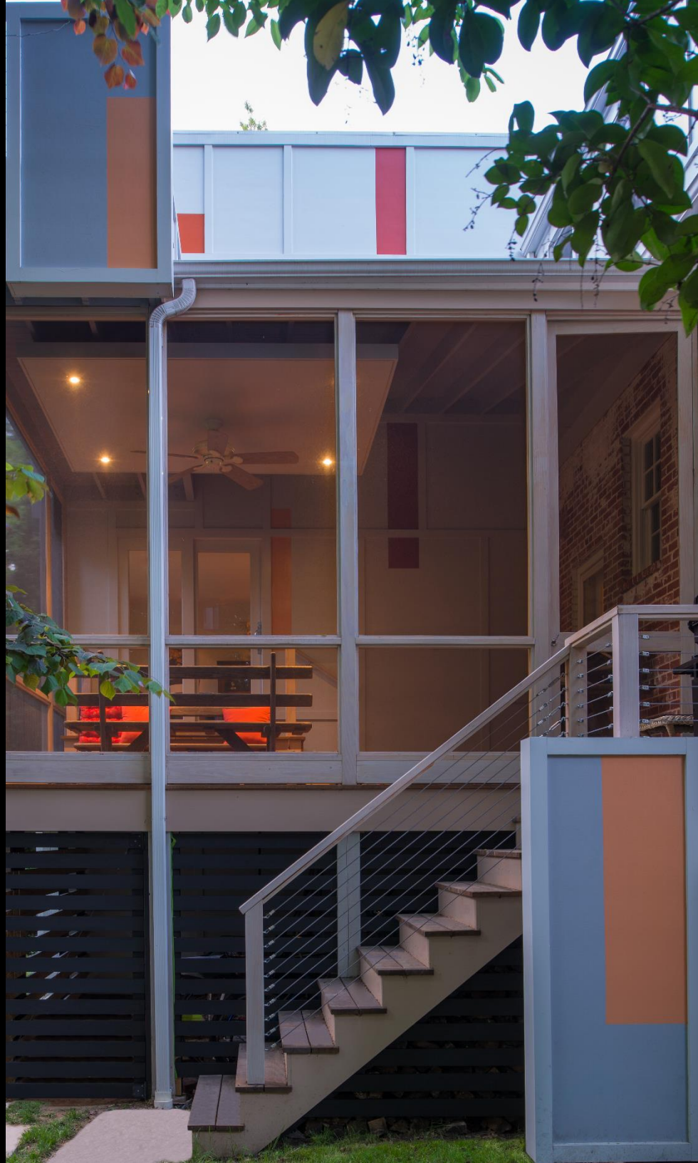
Renovated Side Elevation