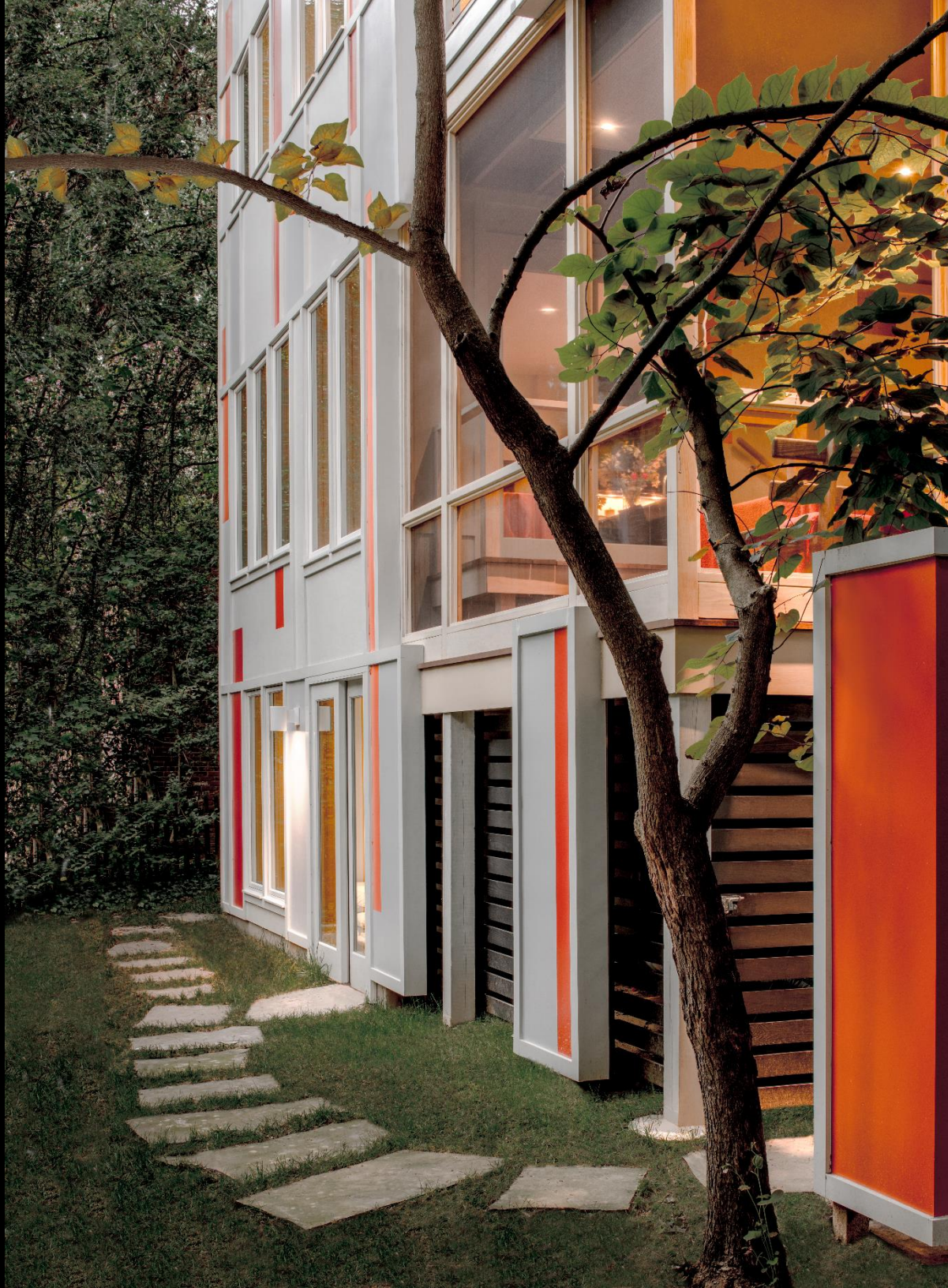
Renovated Rear Elevation