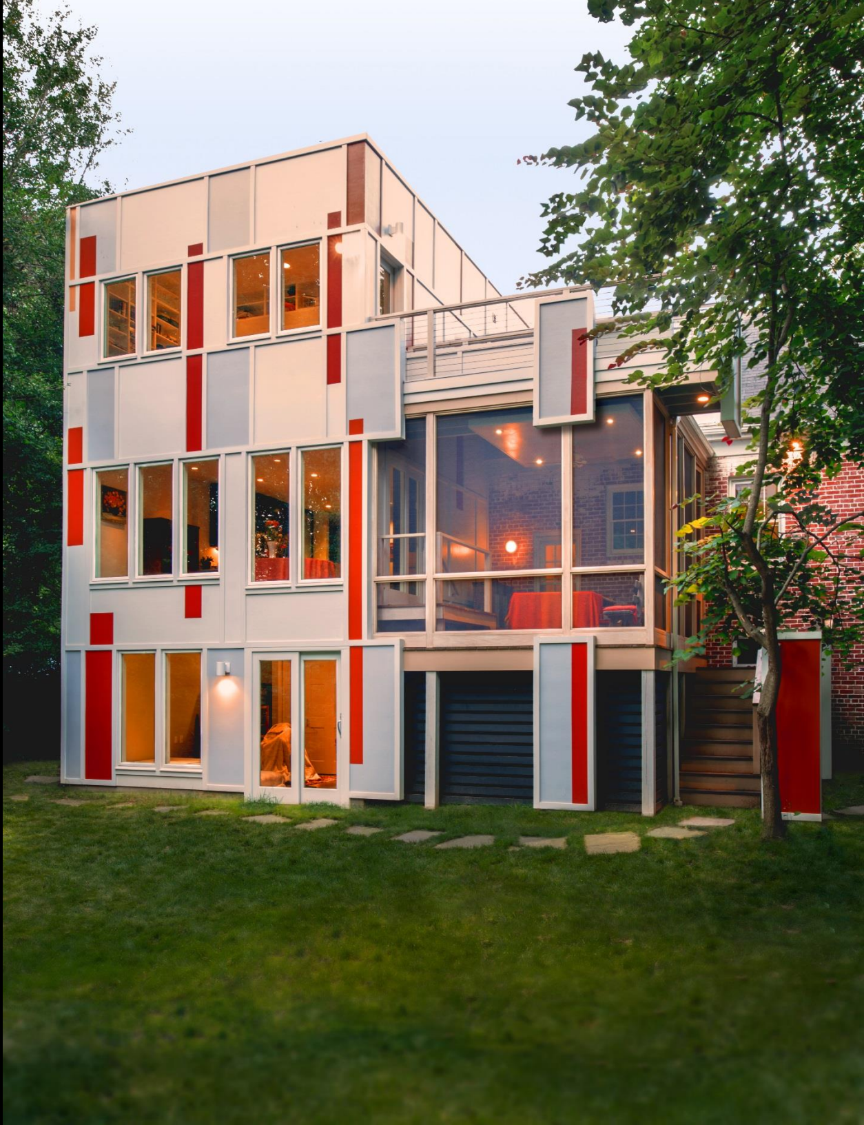
Renovated Rear Elevation