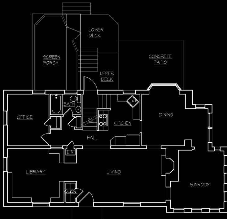
Existing First Floor Plan