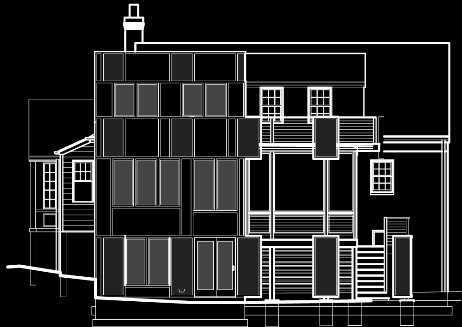
Renovated Rear Elevation