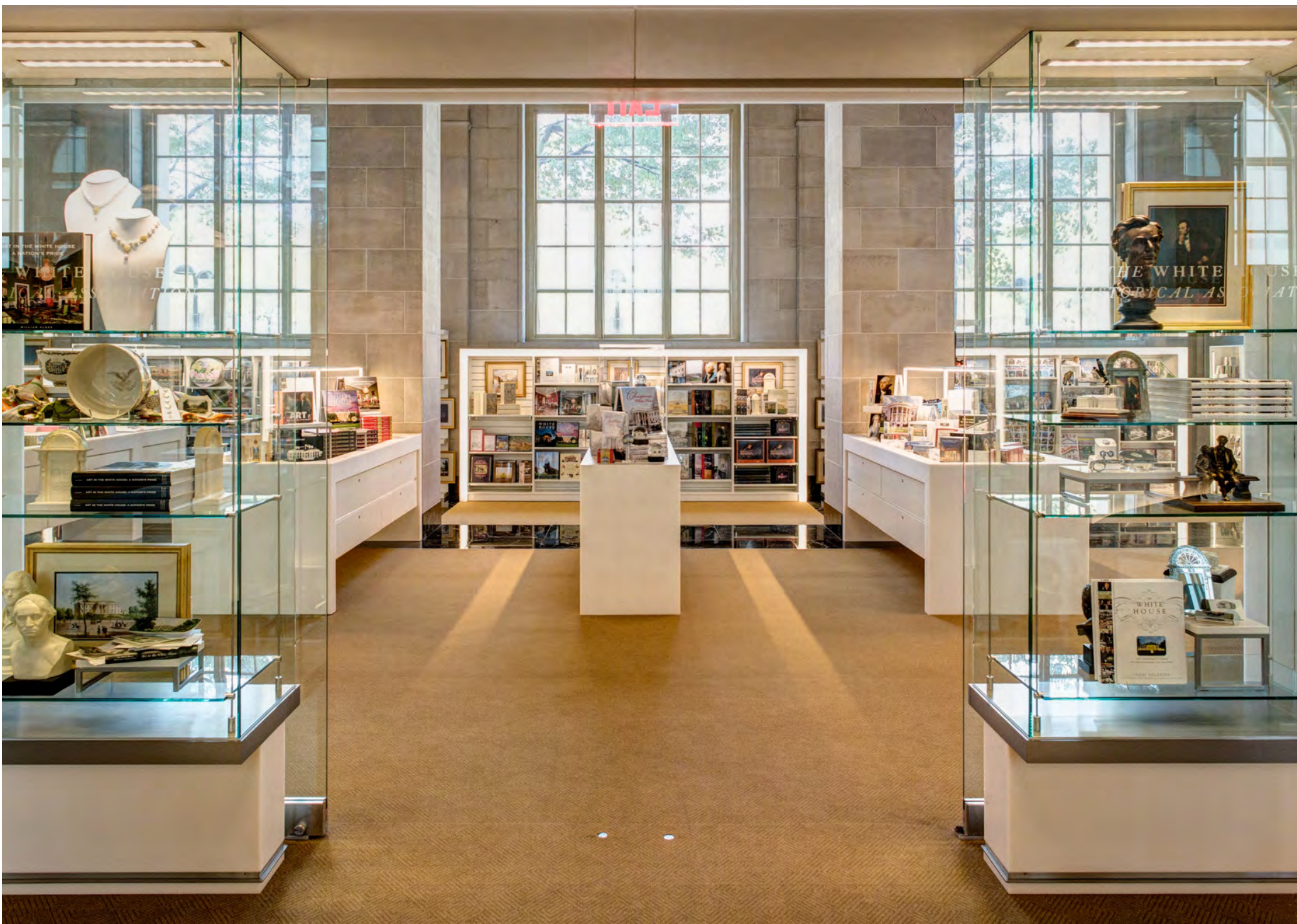
The unobtrusive gift shop preserves the focus on the visitor center's educational mission