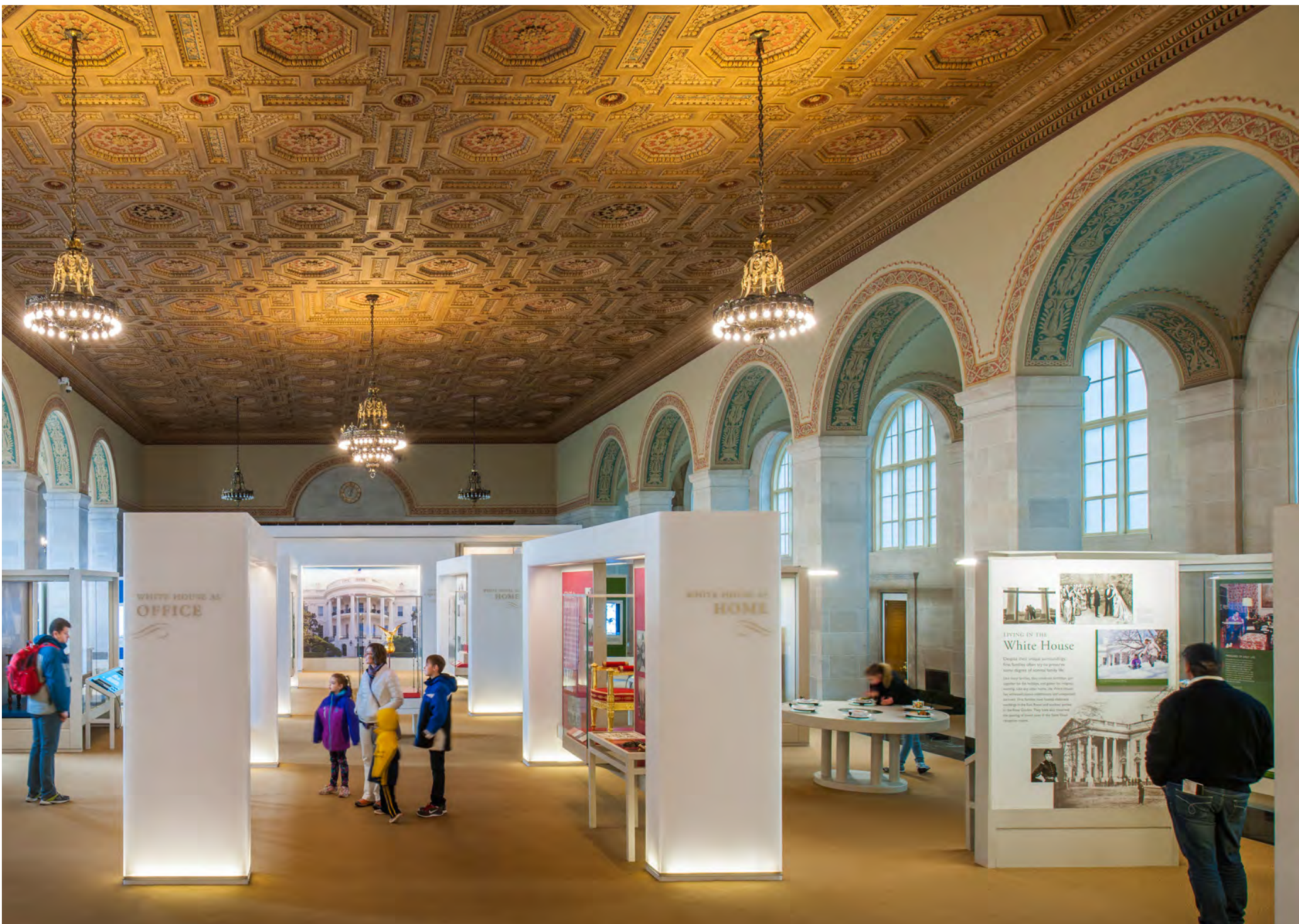
Visitors can once again admire the hall's coffered ceiling, which was previously obscured by overly-bright chandeliers