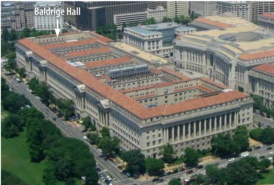
View of U.S. Department of Commerce Building from the Washington Monument