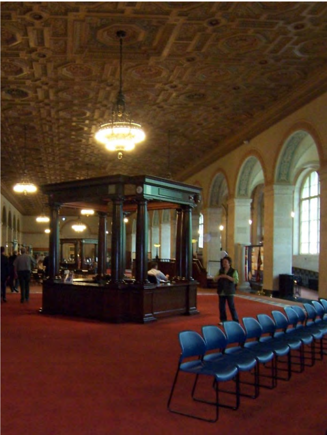
Design team's existing conditions photograph, 2009