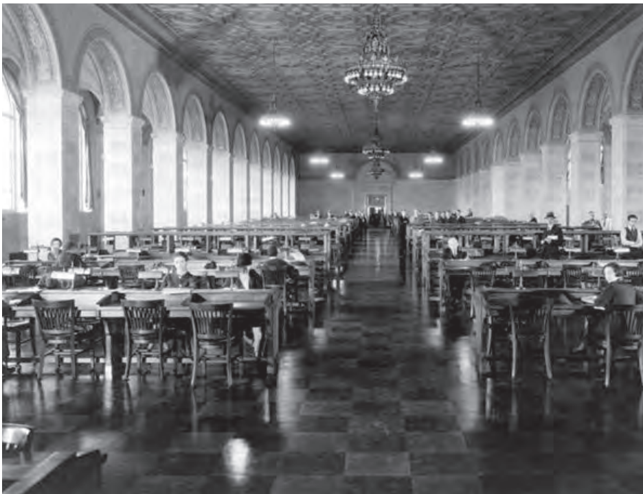
Baldrige Hall in the 1930s