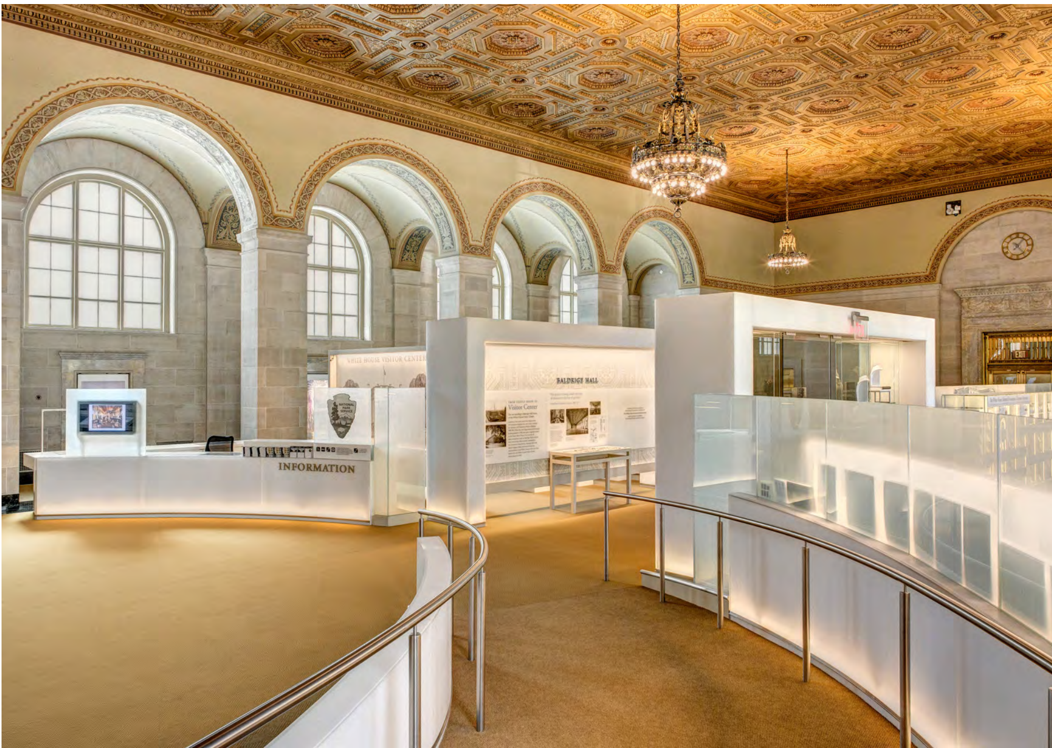
View from entrance ramp