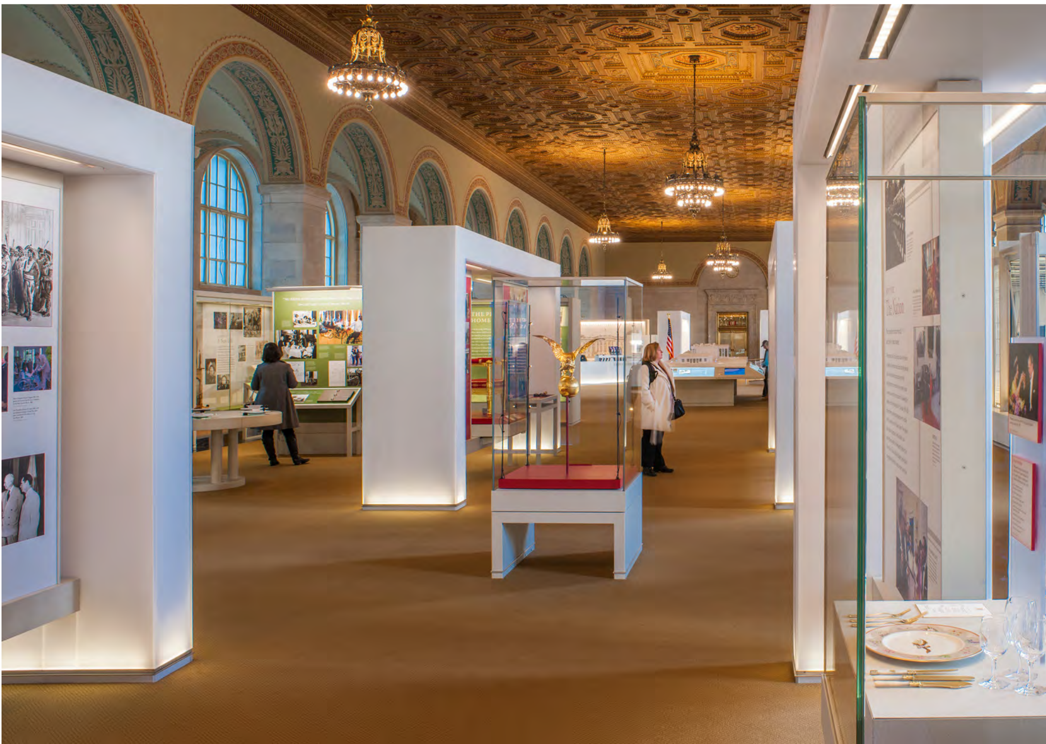
Baldrige Hall today