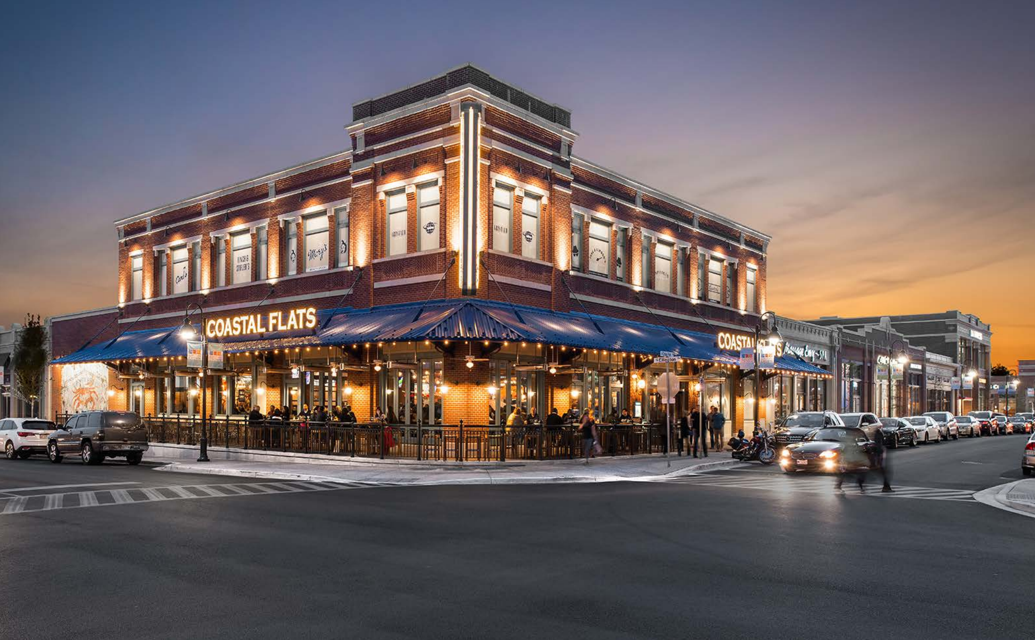
Coastal Flats exterior