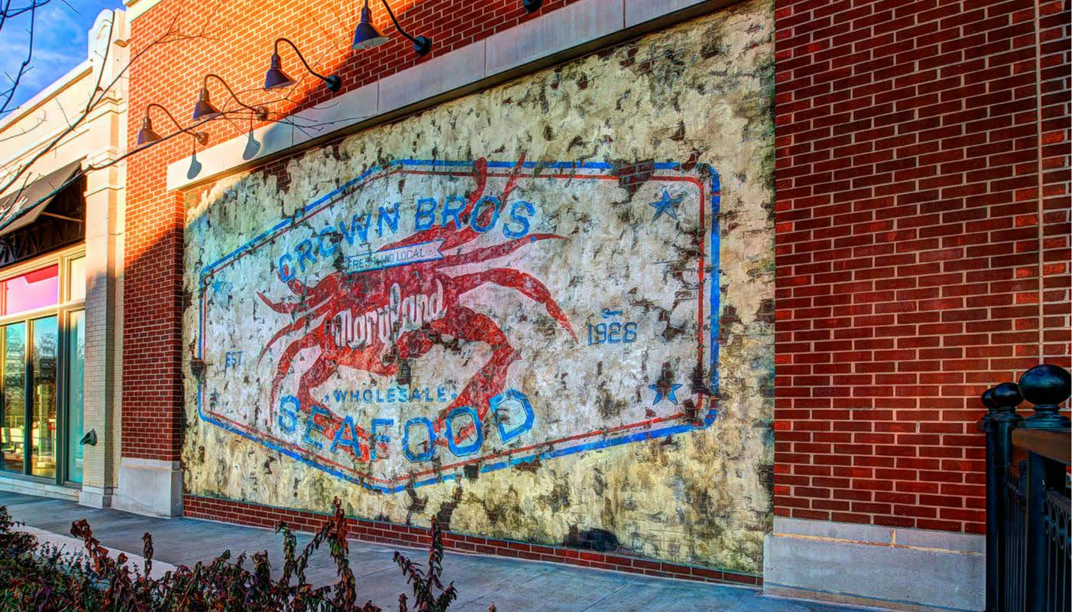
Outdoor mural at Coastal Flats