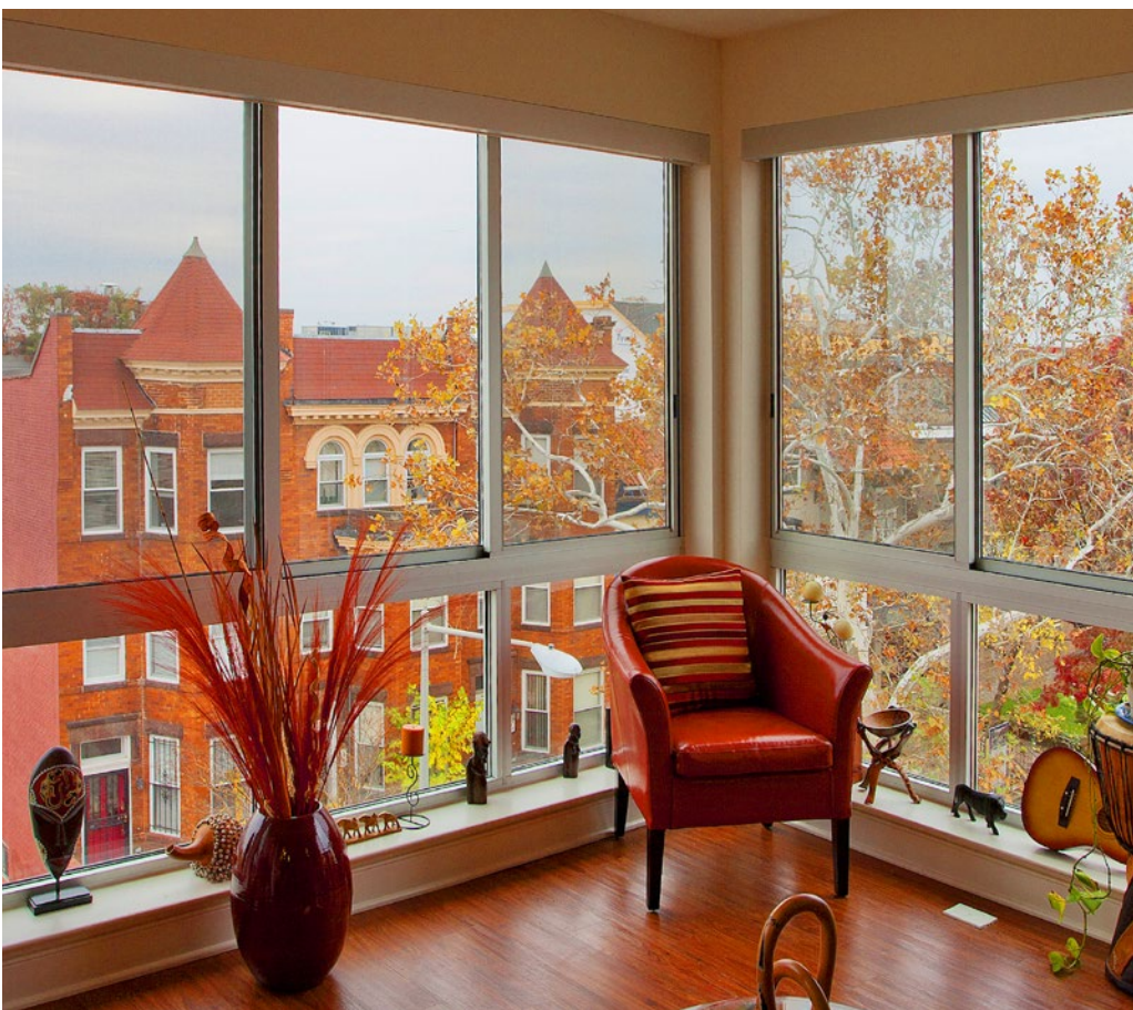
Large windows featured in each unit.