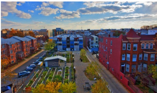
View of public park and surrounding community.