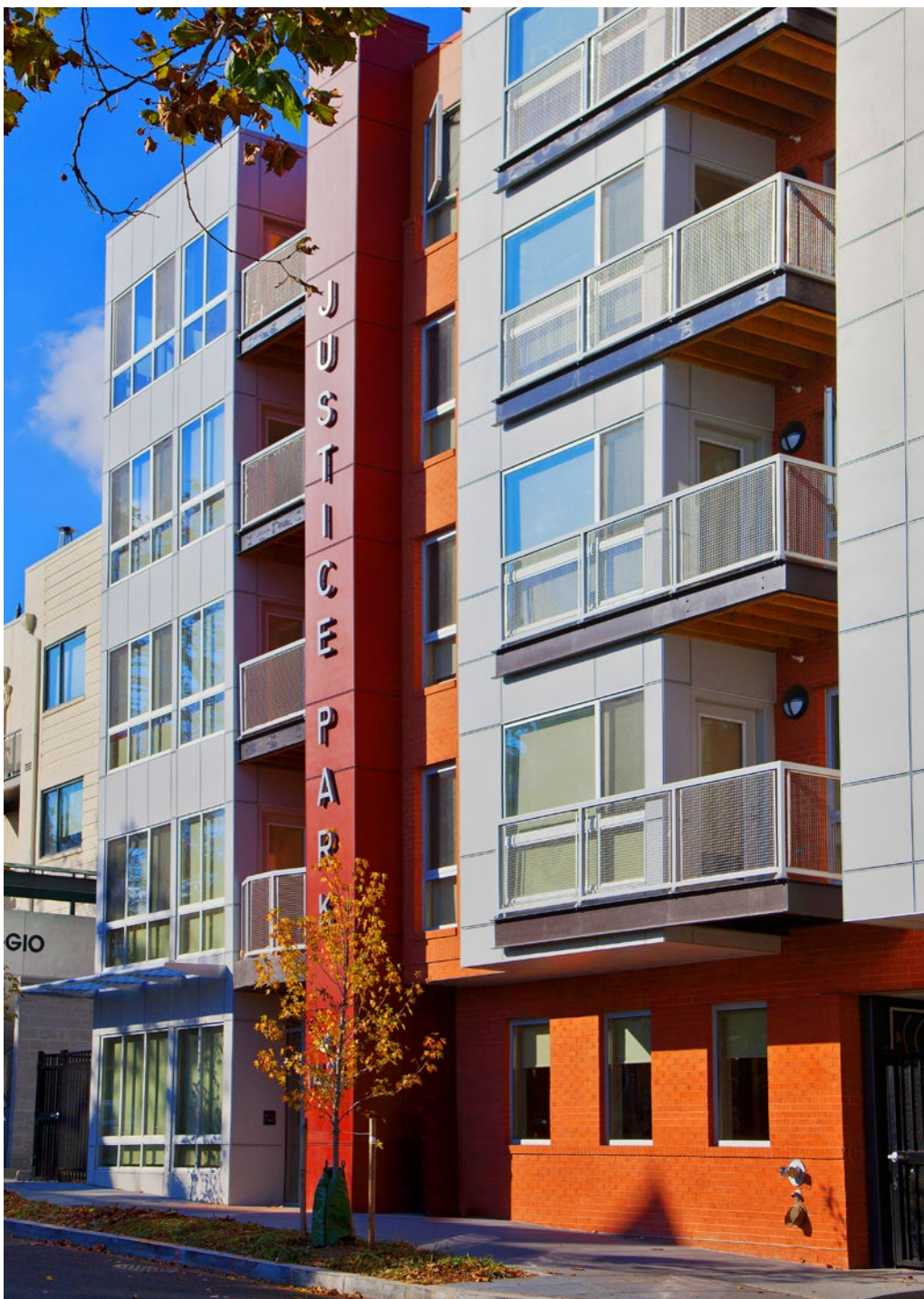
Exterior balconies featured in each unit.