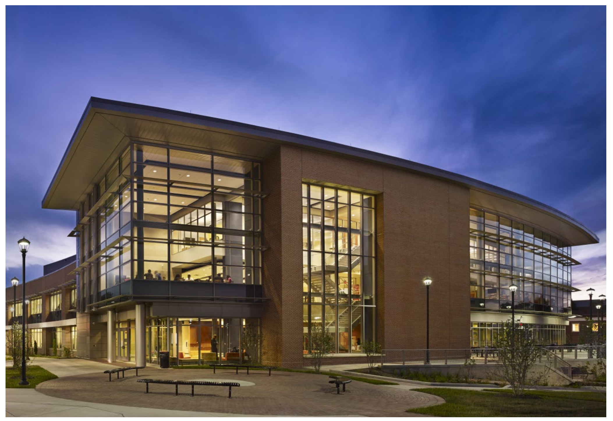
Expansive glazing activates the facade showcasing the activities and community within.