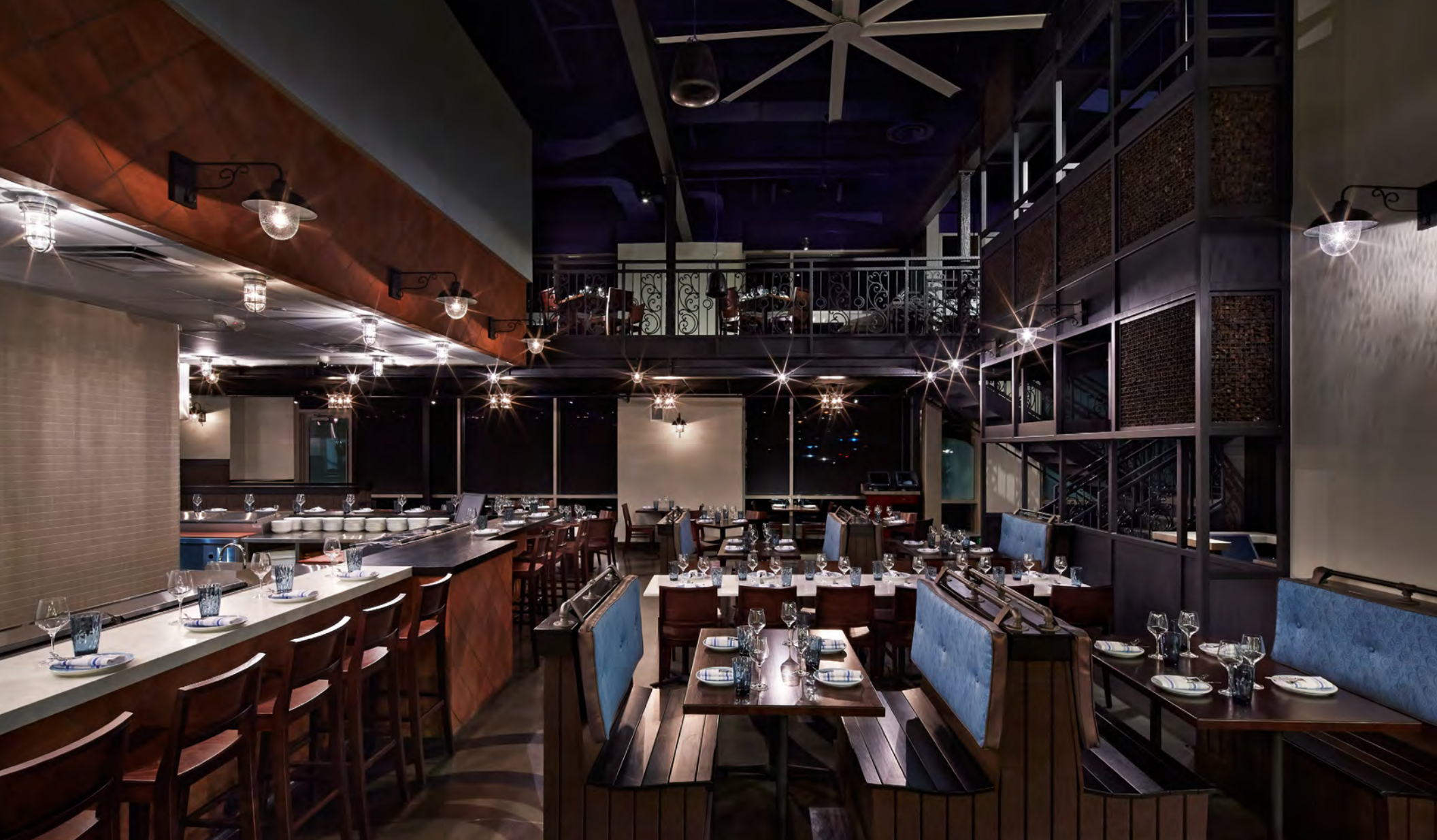
Dining Room + Bar view