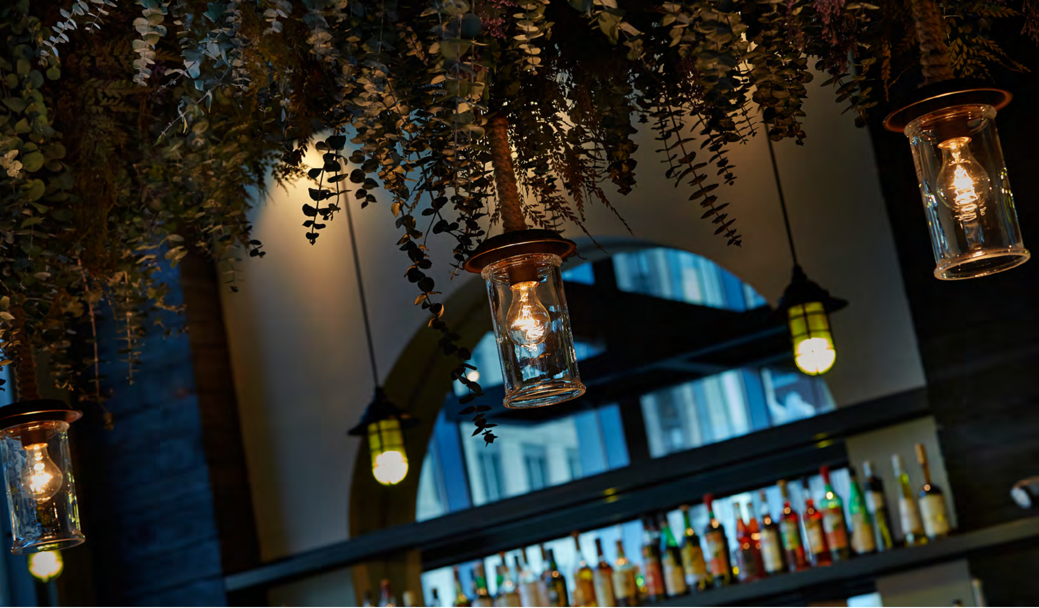
Bar details at Kapnos Taverna