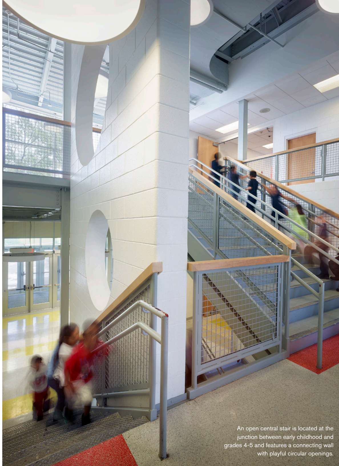
An open central stair is located at the junction between early childhood and grades 4-5 and features a connecting wall with playful circular openings.