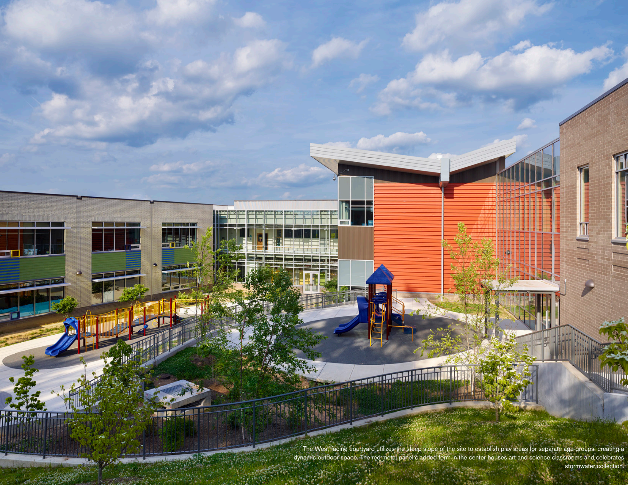
The West-facing courtyard utilizes the steep slope of the site to establish play areas for separate age groups, creating a dynamic outdoor space. The red metal panel clad form in the center houses art and science classrooms and celebrates stormwater collection.