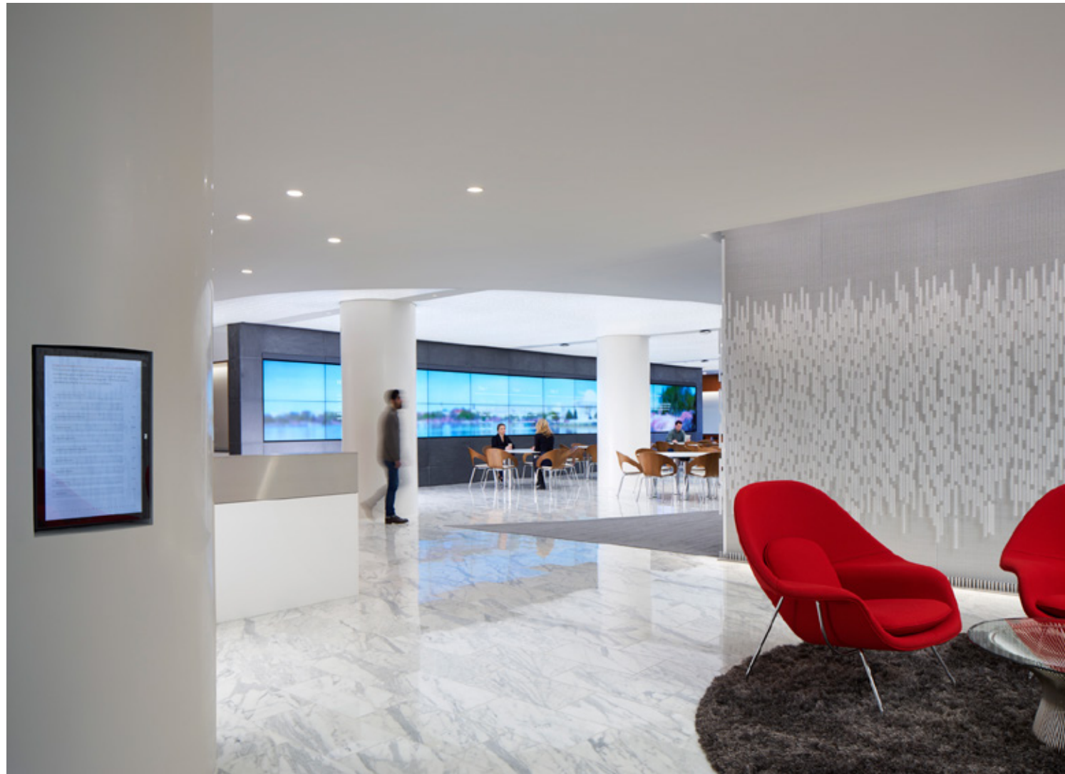
Member Curtain Acrylic rods form an immersive, luminous wall that welcomes guests. A touch screen directs visitors to the location of specific member names on the rods.