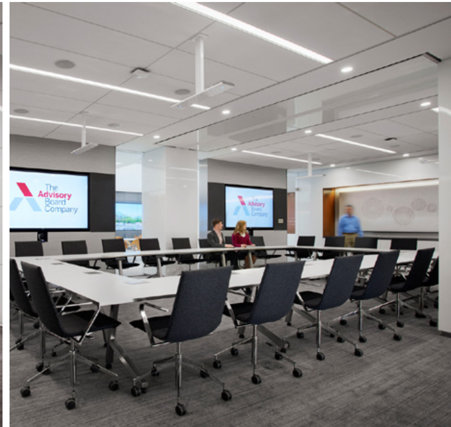
Conference Room Natural slate, walnut accents, neutral fabrics, art, and operable partitions with writable surfaces are integrated into a space that is calming yet technologically rich and versatile.