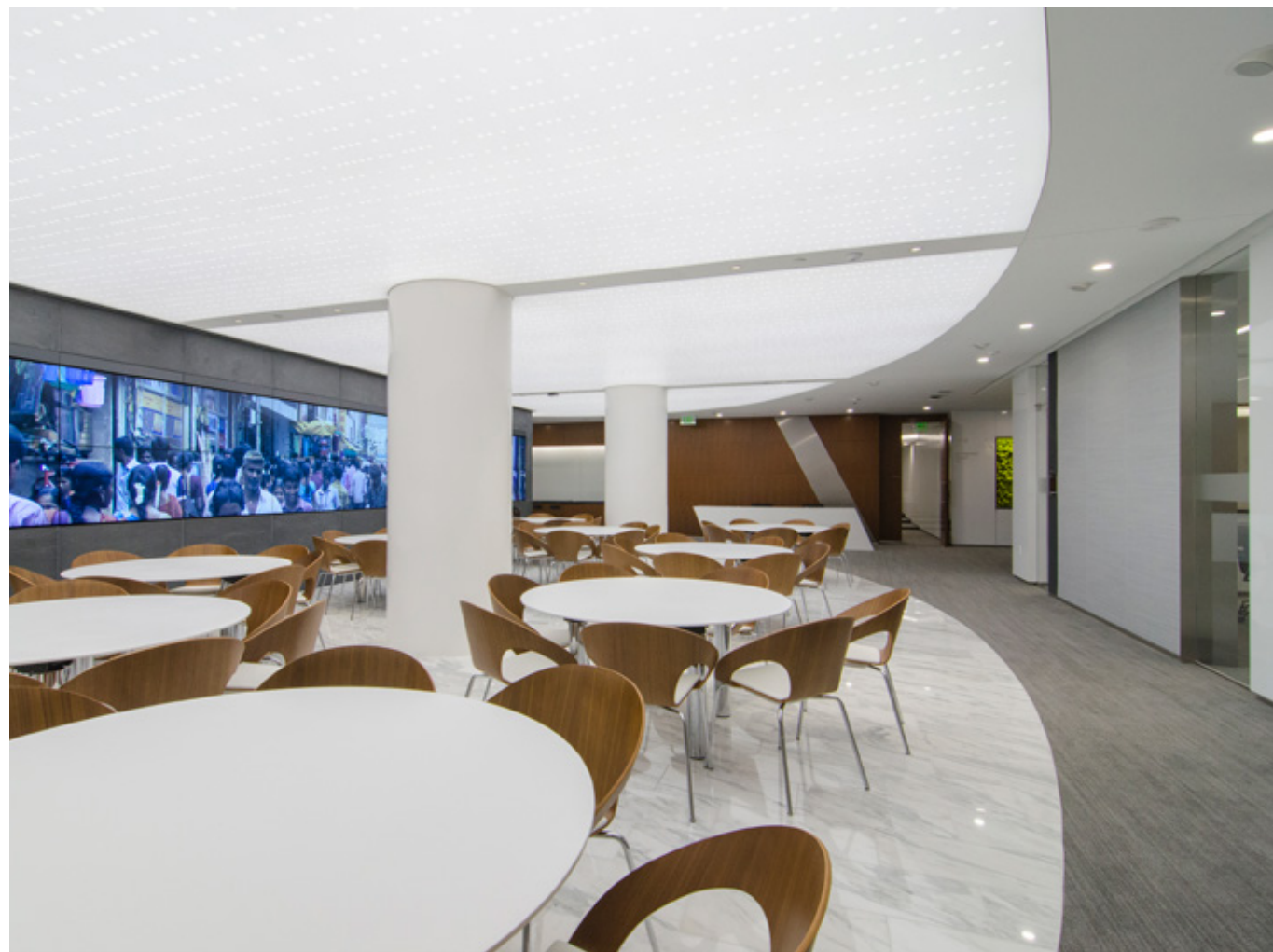
Central Dining This space features a translucent luminous ceiling with a dot pattern integrated into the fabric representing ABC's mission in binary code. A 50' long media wall displays dynamic and changing content throughout the day.