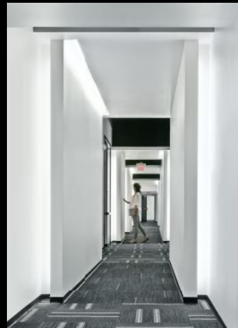
Typical Residence Hallway & Suite Entry