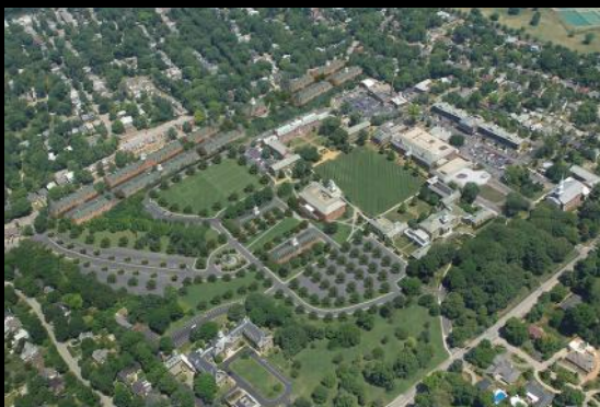
Aerial view of the new master plan

The completed renovation converts the outdated configuration of single rooms & common floor bathrooms to 350 student beds in a 4-person suite arrangement allowing for both double and singles adjacent to the suite's common spaces, with student lounges scattered throughout the building. In the building wings, and facing the main quadrangle, are the Boyce College administration and faculty offices.