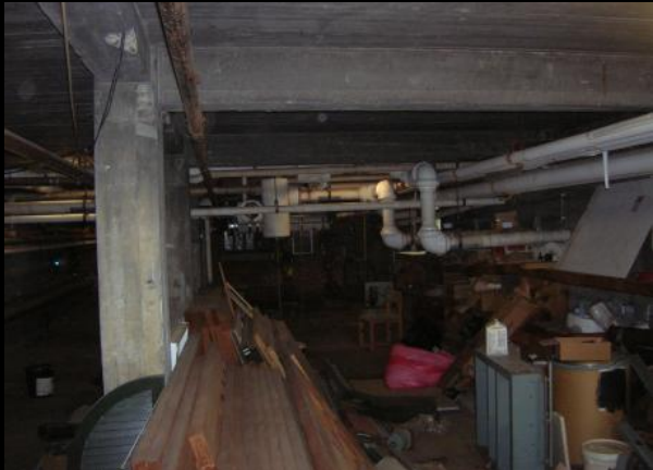
Existing Lower Level