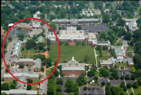
Aerial view of the SBTS campus with Mullins Complex highlighted

The campus of the Southern Baptist Theological Seminary (SBTS) was designed by James Gamble Rogers and the Olmstead Brothers in 1929. Mullins Complex was originally designed as a residence hall and was one of five buildings on the Seminary campus. A new master plan for SBTS called for the restoration of Mullins Complex and creates a new 'Residential College' nested in the predominantly Graduate level Seminary. As part of the first completed project of SBTS's master plan, the building houses the Boyce College's residences, student lounges, faculty and administration.