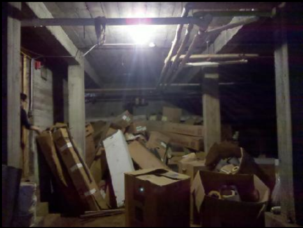
Existing Lower Level