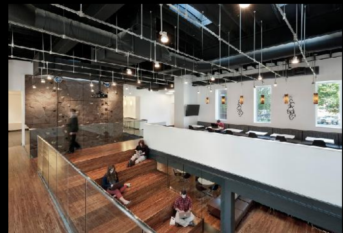
Student Center from Upper Level