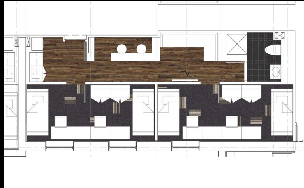
Floor Plan of Four Person Suite