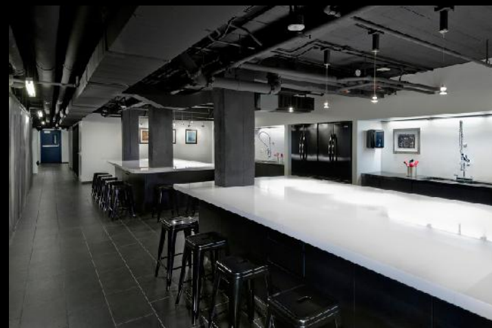
Student Center Kitchens