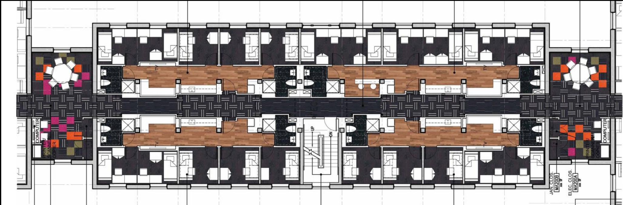
Floor Plan of One Wing of the Complex