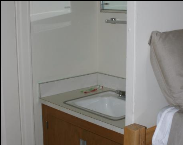
Existing Sink in Individual Room