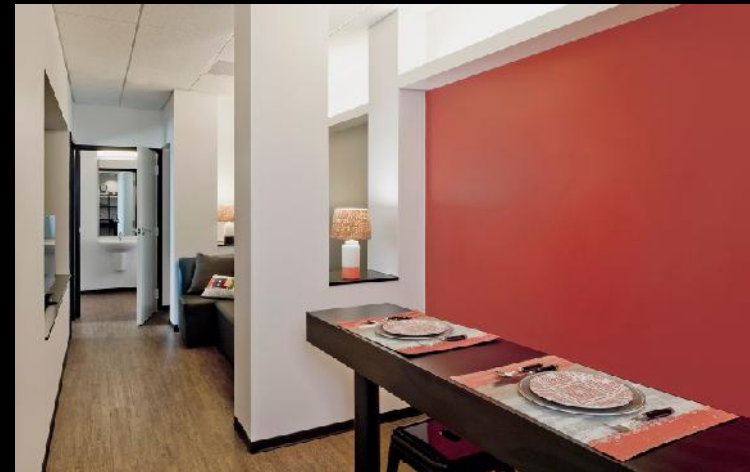
Suite Common Area