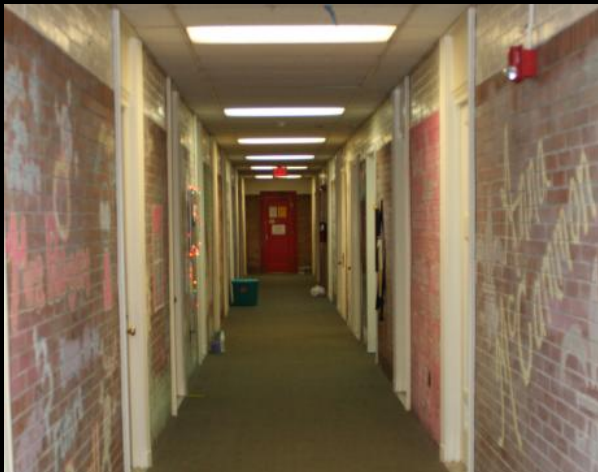
Existing Hallway & Room Entry