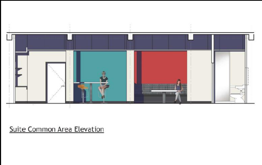
Suite Common Area Elevation