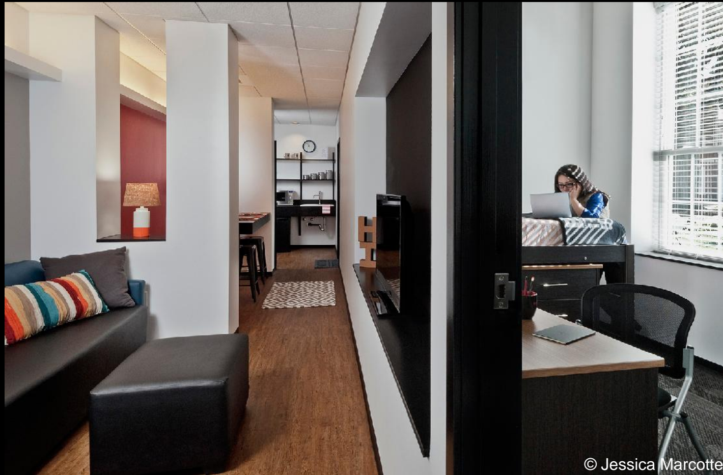
Suite Common Area and Individual Room