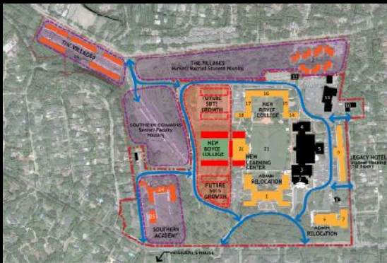
Planning diagram of the new master plan

The campus of the Southern Baptist Theological Seminary (SBTS) was designed by James Gamble Rogers and the Olmstead Brothers in 1929. Mullins Complex was originally designed as a residence hall and was one of five buildings on the Seminary campus. A new master plan for SBTS called for the restoration of Mullins Complex and creates a new 'Residential College' nested in the predominantly Graduate level Seminary. As part of the first completed project of SBTS's master plan, the building houses the Boyce College's residences, student lounges, faculty and administration.