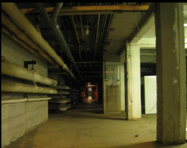
Existing Lower Level