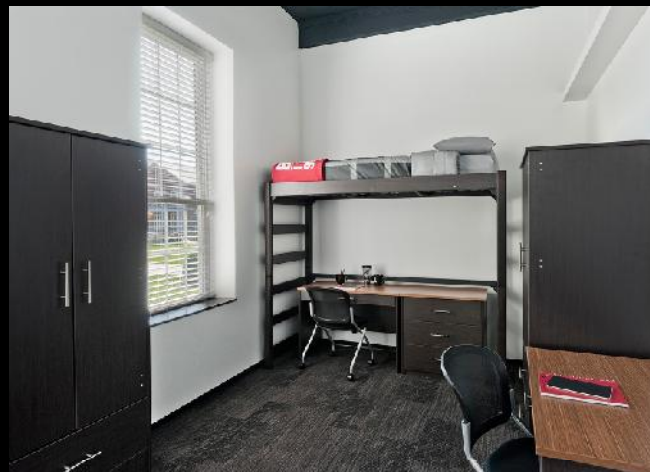
Typical Student Room with Flexible Furniture