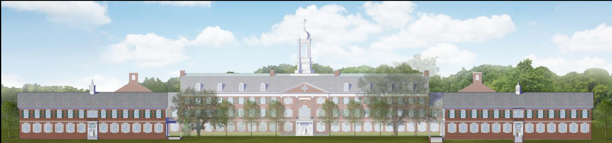
Elevation Facing Campus Green