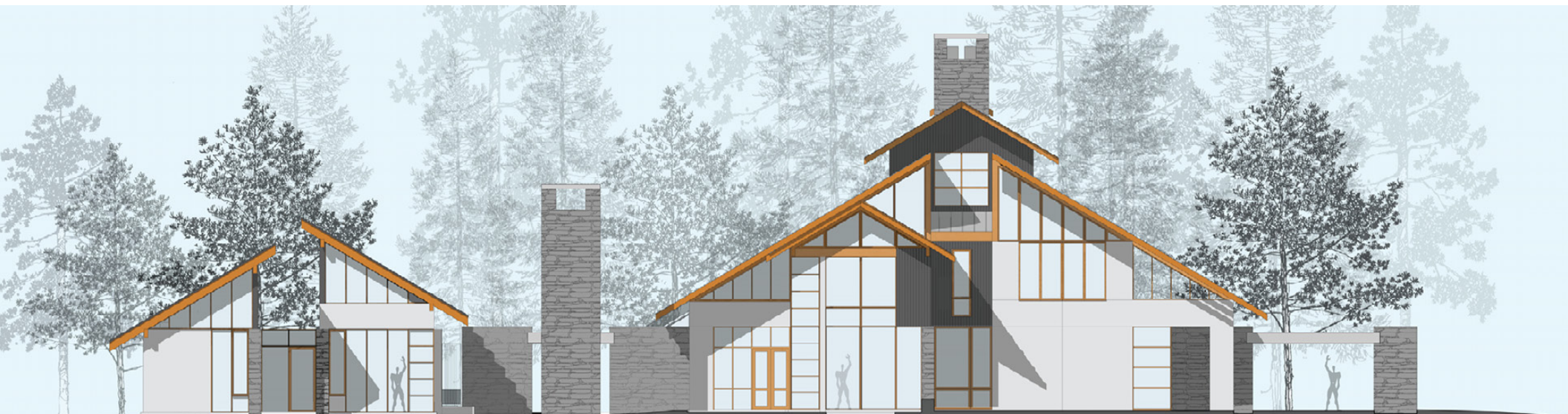
Phase 2 - Guest house, terraces, lap pool