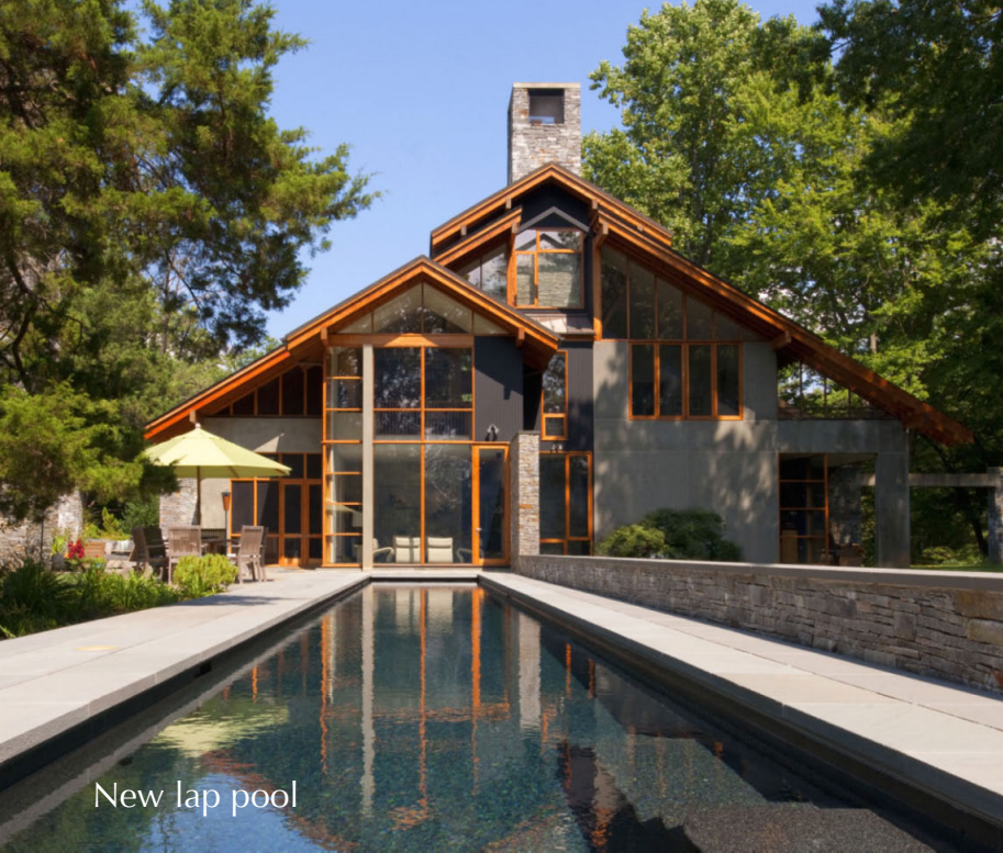
New lap pool