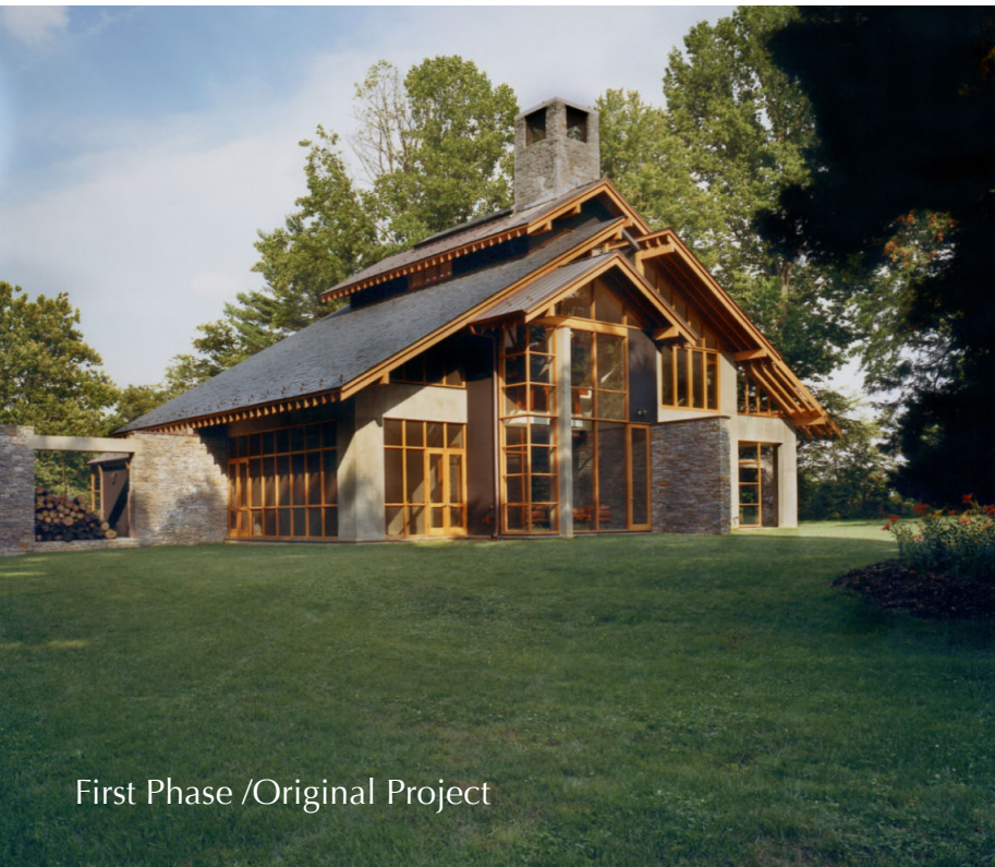
First Phase /Original Project