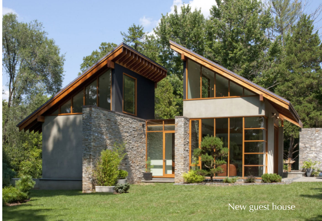
New guest house