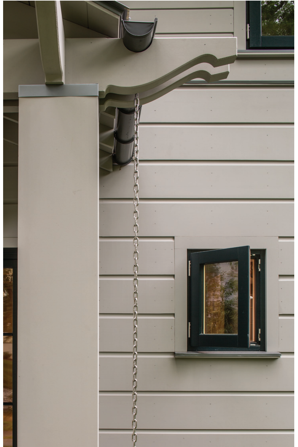
COVERED ENTRY BRACKET DETAIL