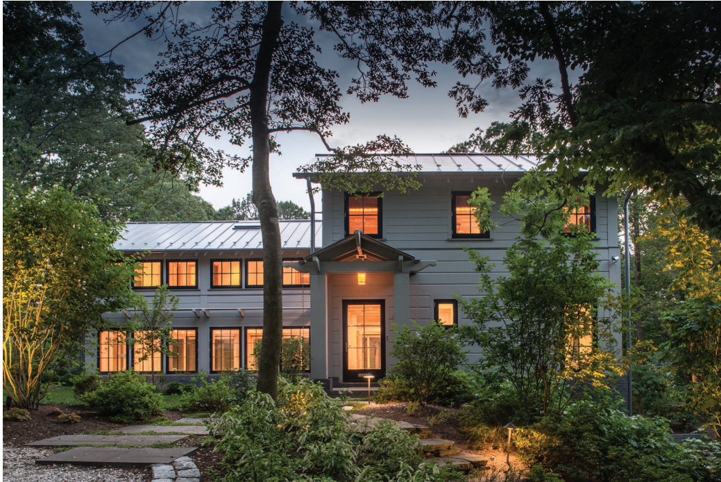
EAST FACADE OF FRONT WING AND REAR WING BEYOND