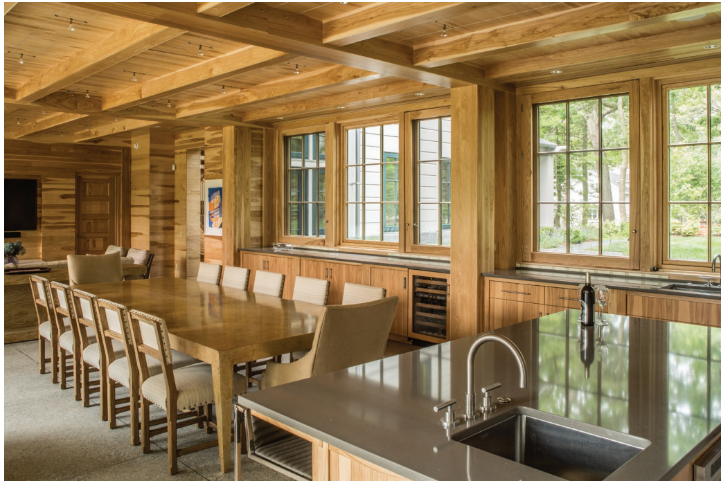
KITCHEN, DINING ROOM, & FAMILY ROOM