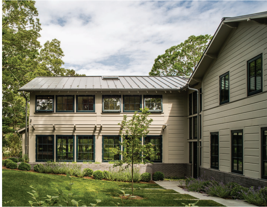
EAST FACADE OF REAR WING