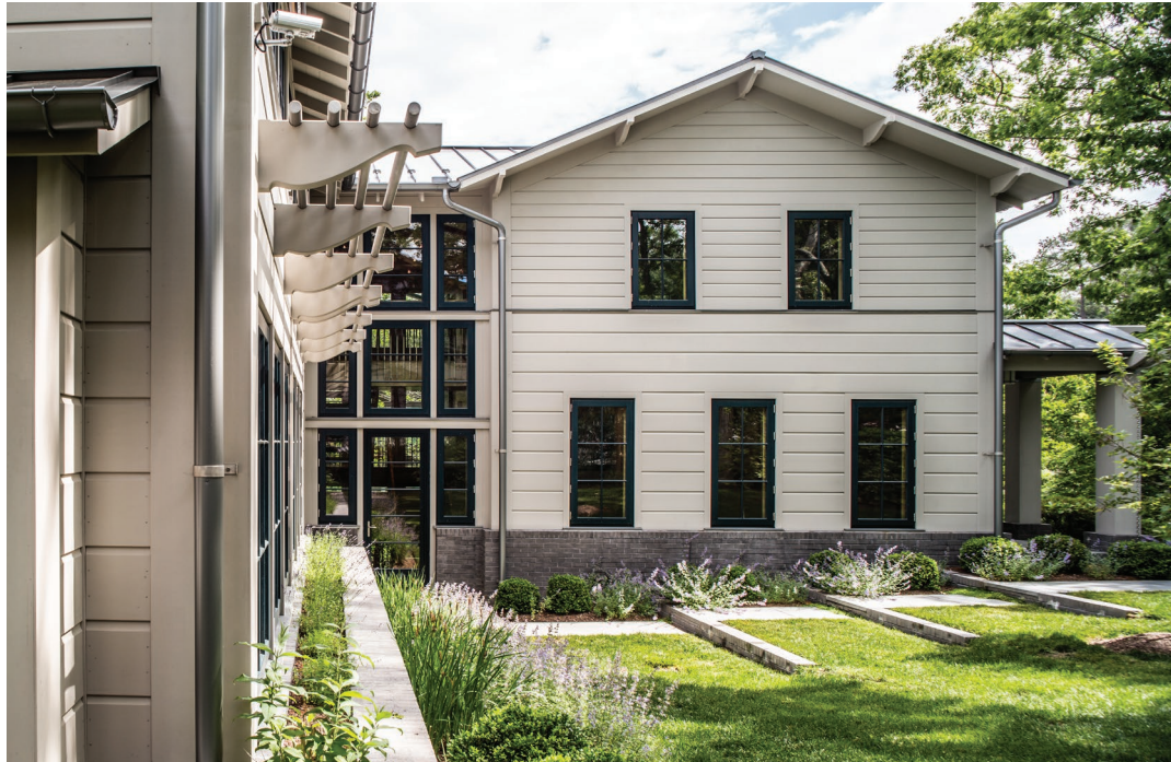
SOUTH FACADE OF FRONT WING WITH STAIR HALL HYPHEN