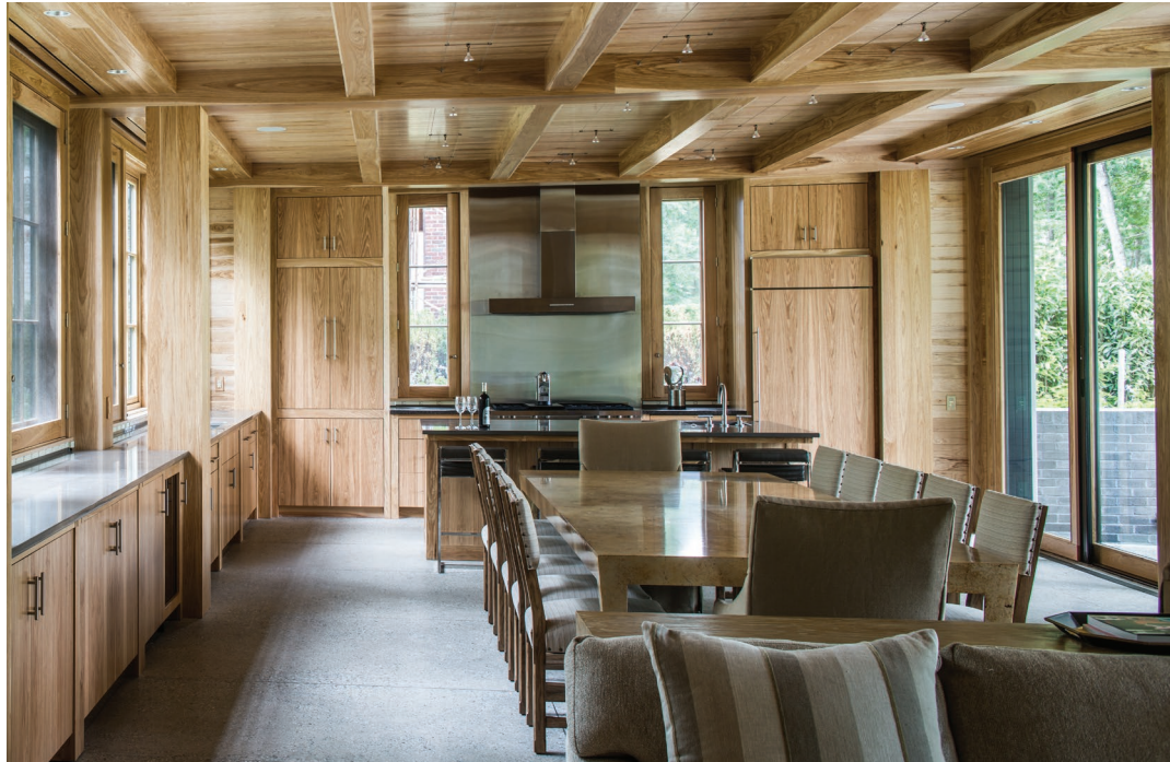
DINING ROOM & KITCHEN