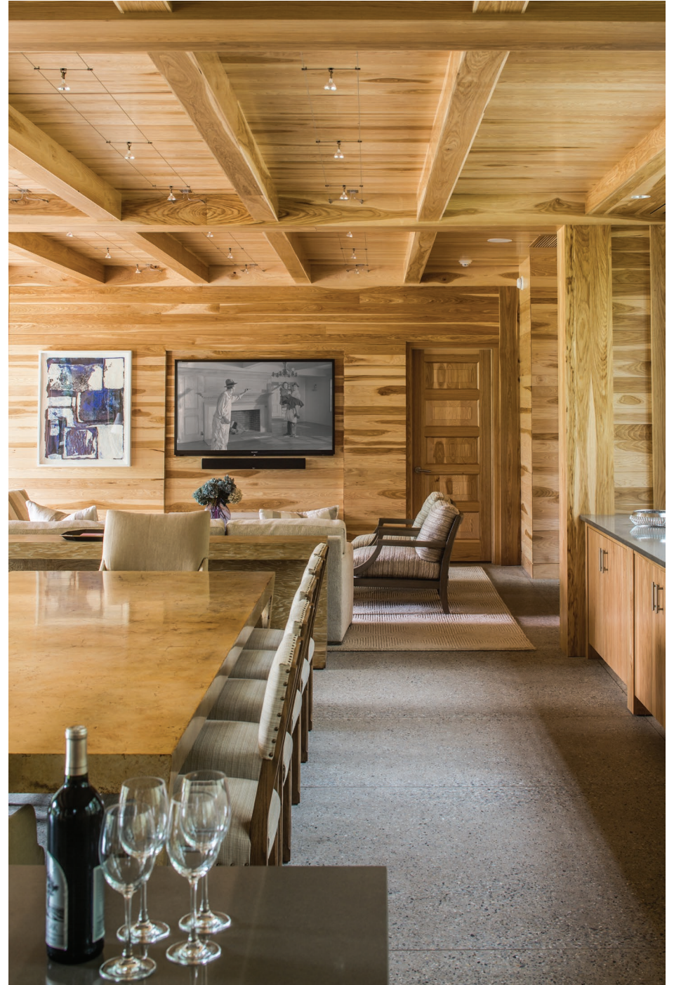
DINING ROOM & FAMILY ROOM