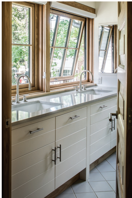
SECOND FLOOR BATH