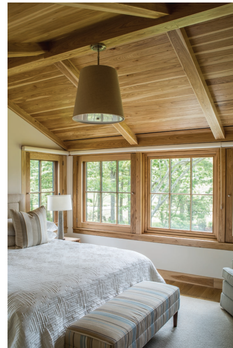
SECOND FLOOR BEDROOM