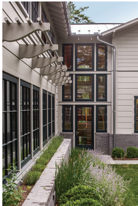
TRELLIS DETAIL WITH STAIR HYPHEN BEYOND