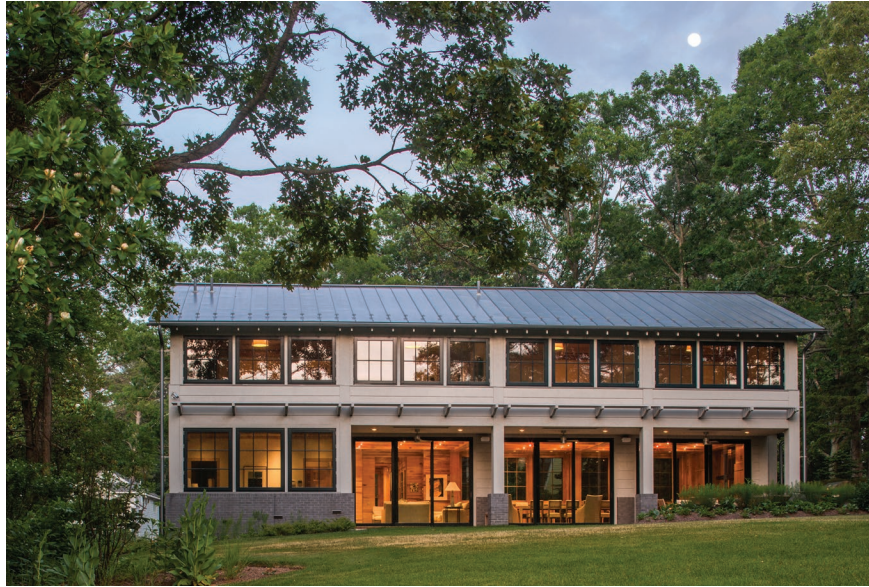
REHOBOTH HOUSE Henlopen Acres, DE