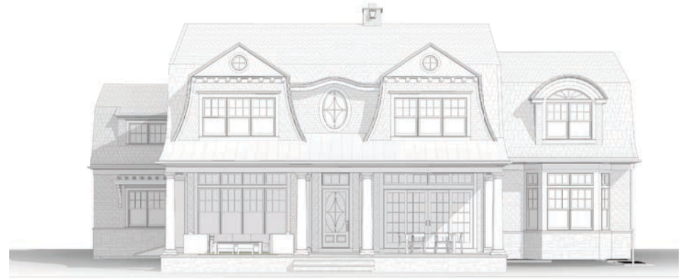
EXTERIOR PERSPECTIVE OF WATER SIDE OF HOME.