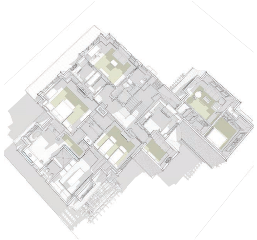
SECOND FLOOR PLAN PERSPECTIVE