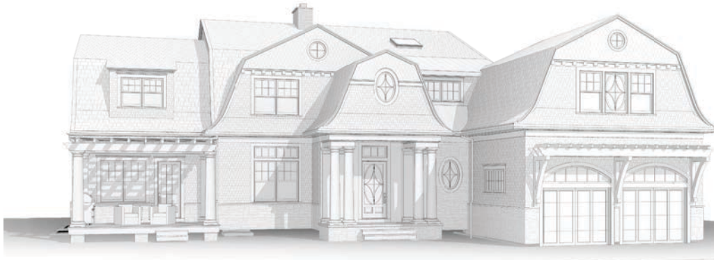
08 EXTERIOR PERSPECTIVE OF STREET SIDE OF HOME.