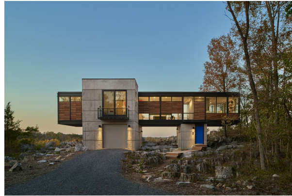
Approaching Hawks Nest