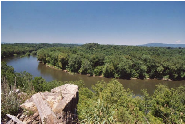
View of the Potomac River