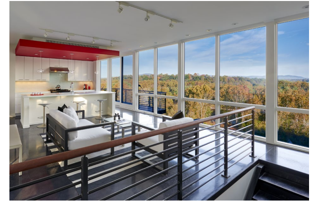
View looking northwest

The client was drawn to the site, the top of a bluff of an abandoned limestone quarry in West Virginia with sweeping views of the Potomac River. The house and artist studio was sited at the edge of the 100 foot cliff to take full advantage of the magnificent view. In response to the client request that the house be “of the place”, concrete walls rise from limestone while leaving the rock-strewn landscape undisturbed. Anchored to the bedrock with caissons that extend down into fissures in the rock, the concrete walls support a cantilevered steel and glass structure above.