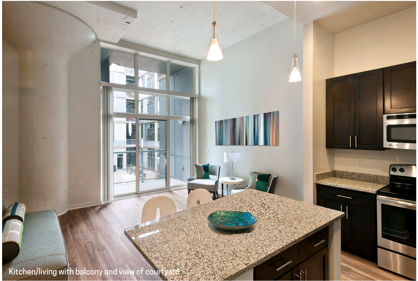
Kitchen/living with balcony and view of courtyard