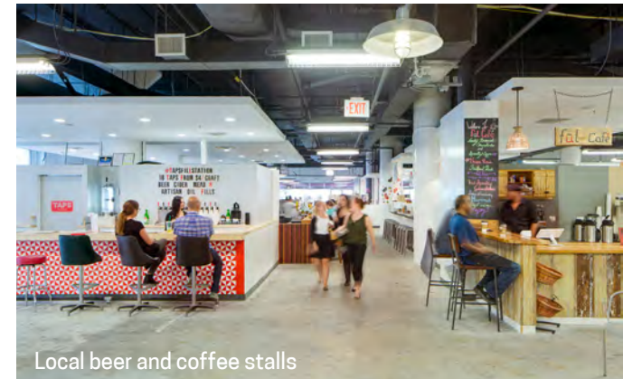
Local beer and coffee stalls