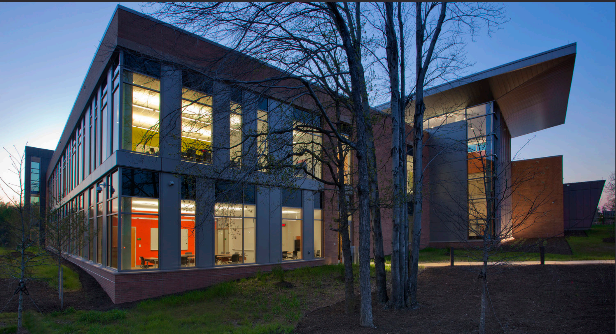
view from Neabsco Mills Road and North College Drive