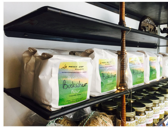
Custom fabricated shelving