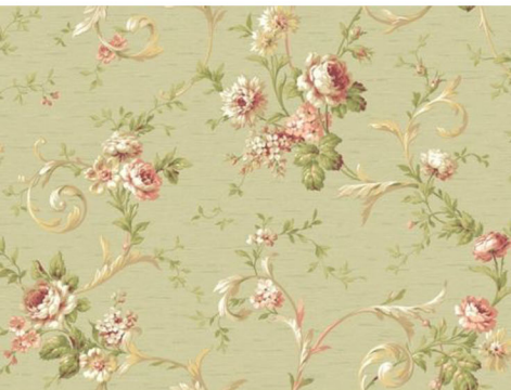
Early 20th c. color palette (building's age)