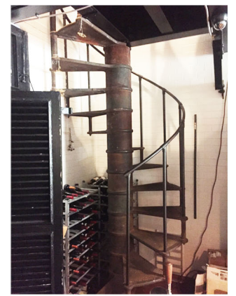
Salvaged spiral stair