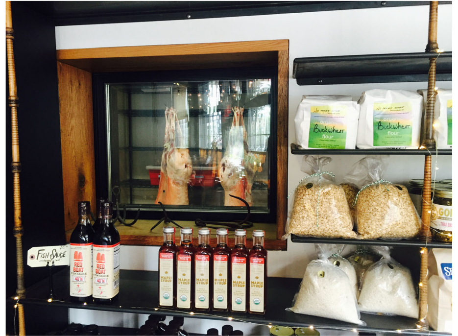
View from butcher shop into freezer