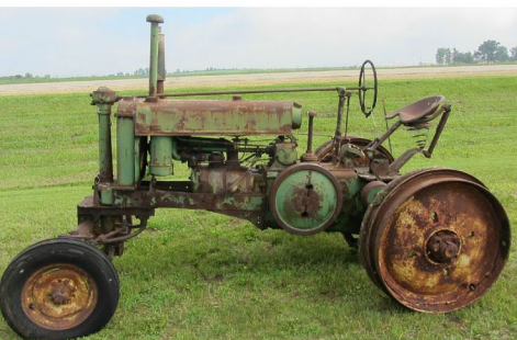
Agrarian allusion (local sourcing)