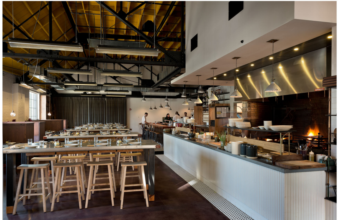
Prep line and bar