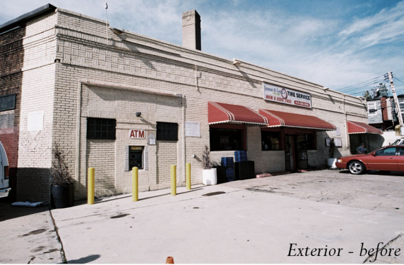
Exterior - before