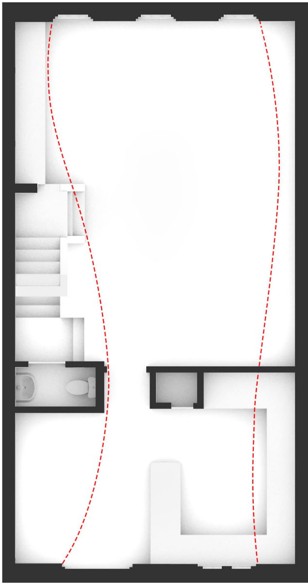
Before plan overlayed with new geometry