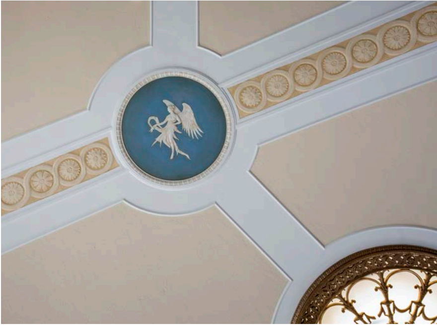
Renovated Space & Plasterwork CONSTITUTION HALL LOBBY

“ The restoration [...] recovered the richness of the decorative plaster details, returning the spaces to their original grandeur.”