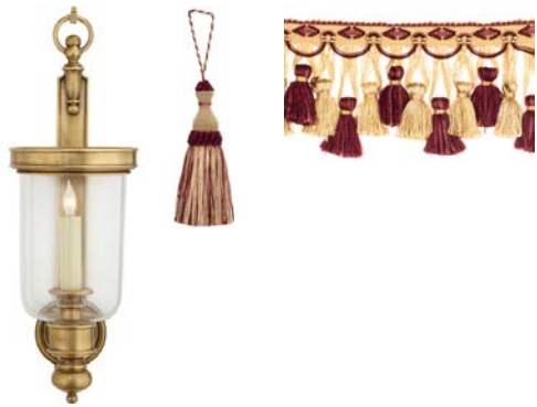
Decorative Selections CONSTITUTION HALL LOBBY