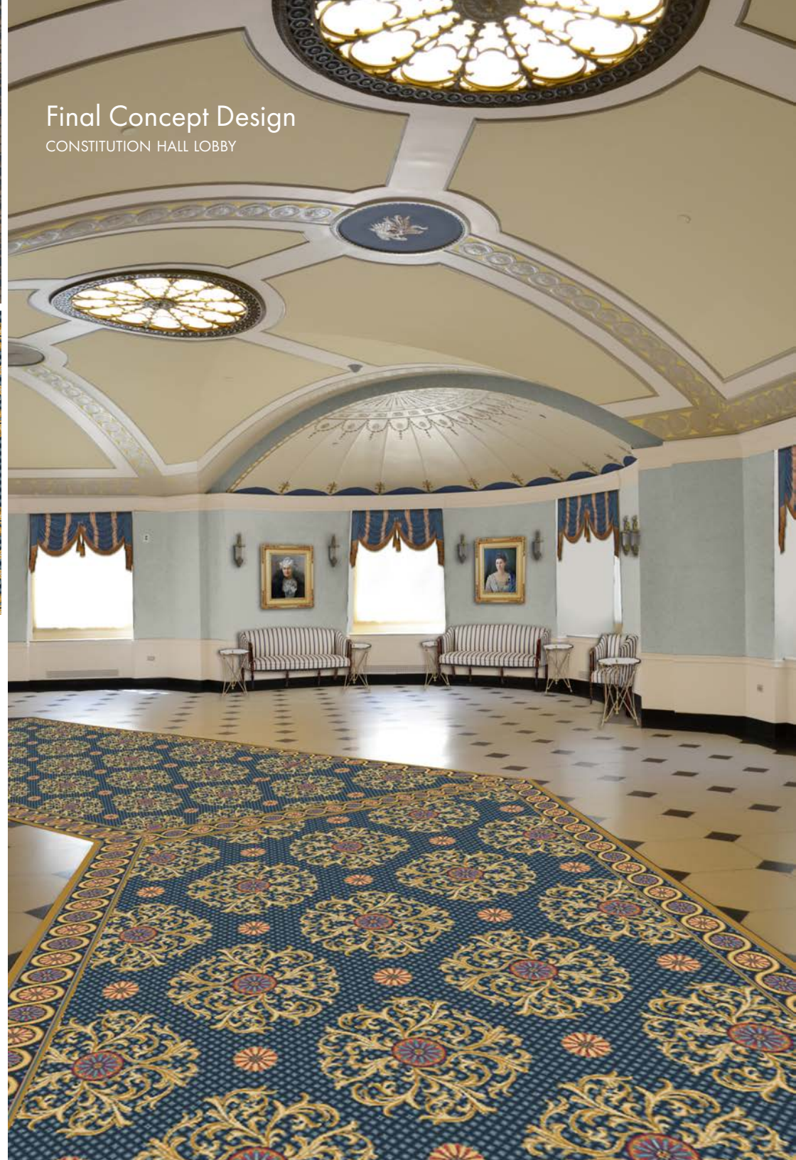
Final Concept Design CONSTITUTION HALL LOBBY