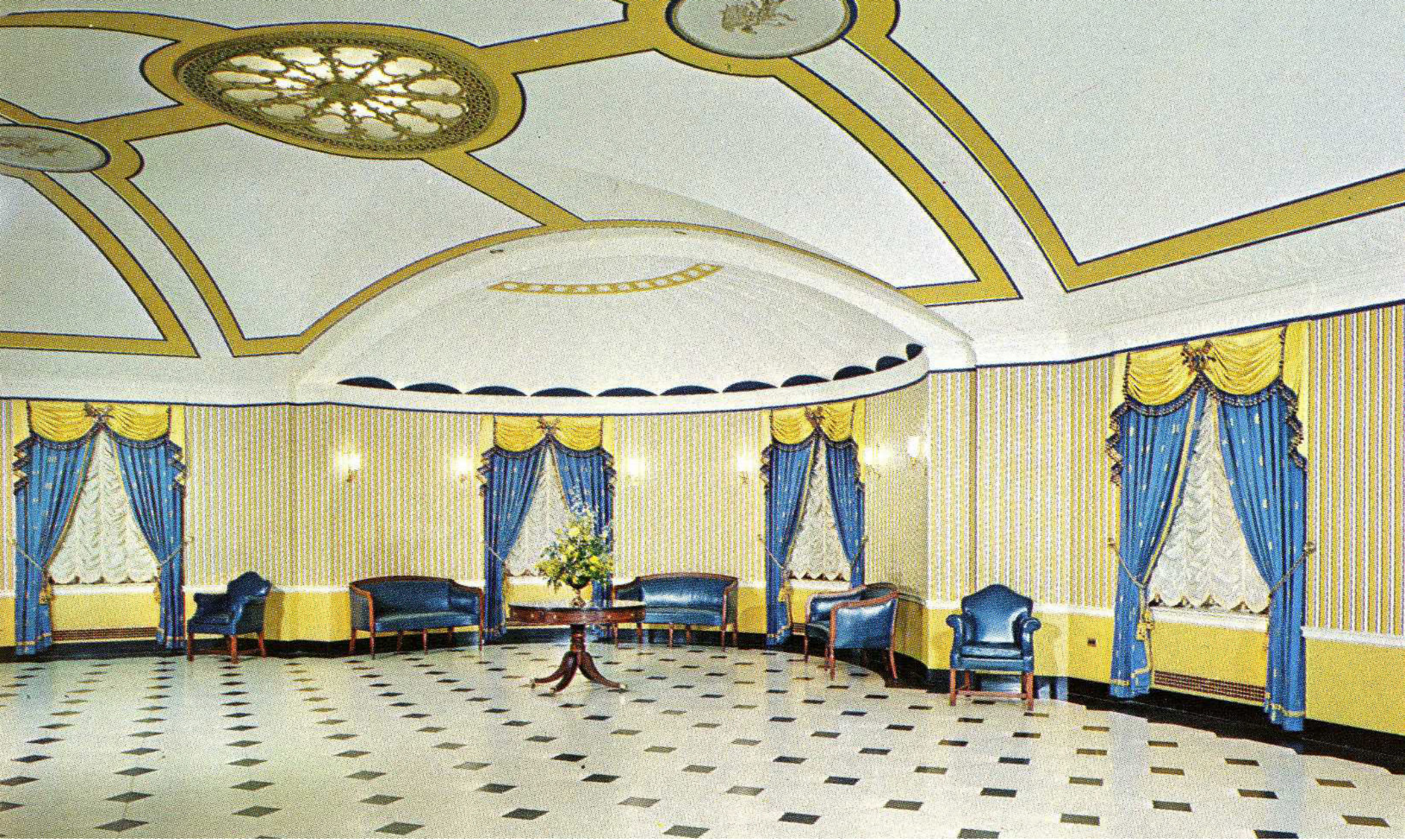
Northwest Niche CONSTITUTION HALL LOBBY