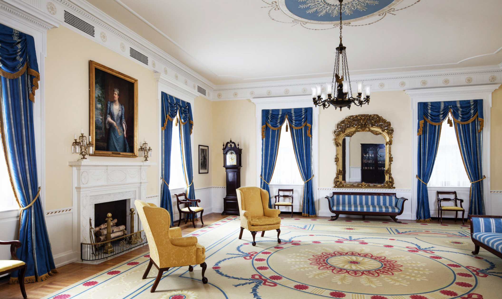
Renovated Space PRESIDENT GENERAL'S RECEPTION ROOM