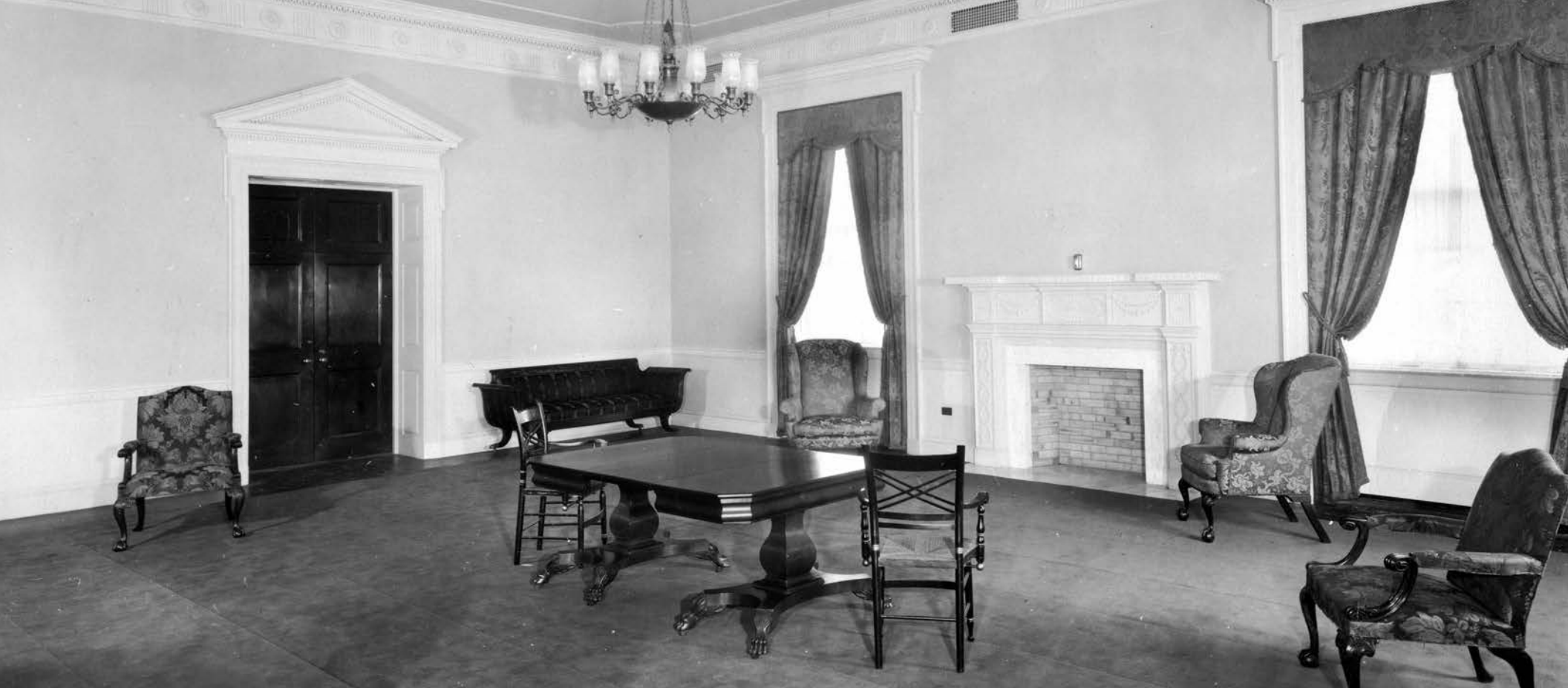
Historic Photographs PRESIDENT GENERAL'S RECEPTION ROOM