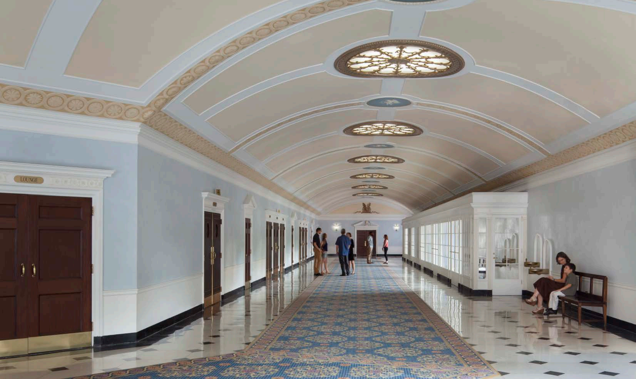
Renovated Space CONSTITUTION HALL LOBBY