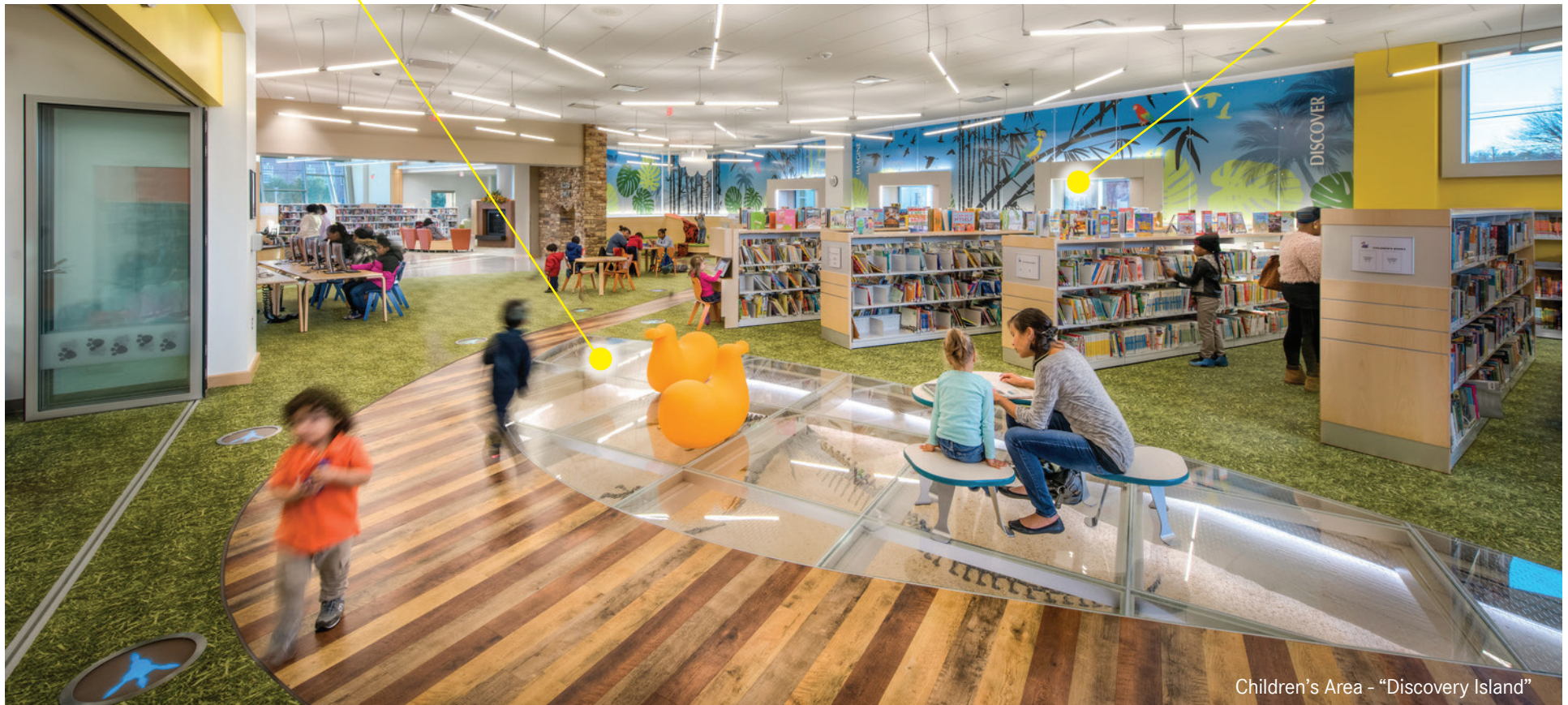
Children's Area - "Discovery Island"