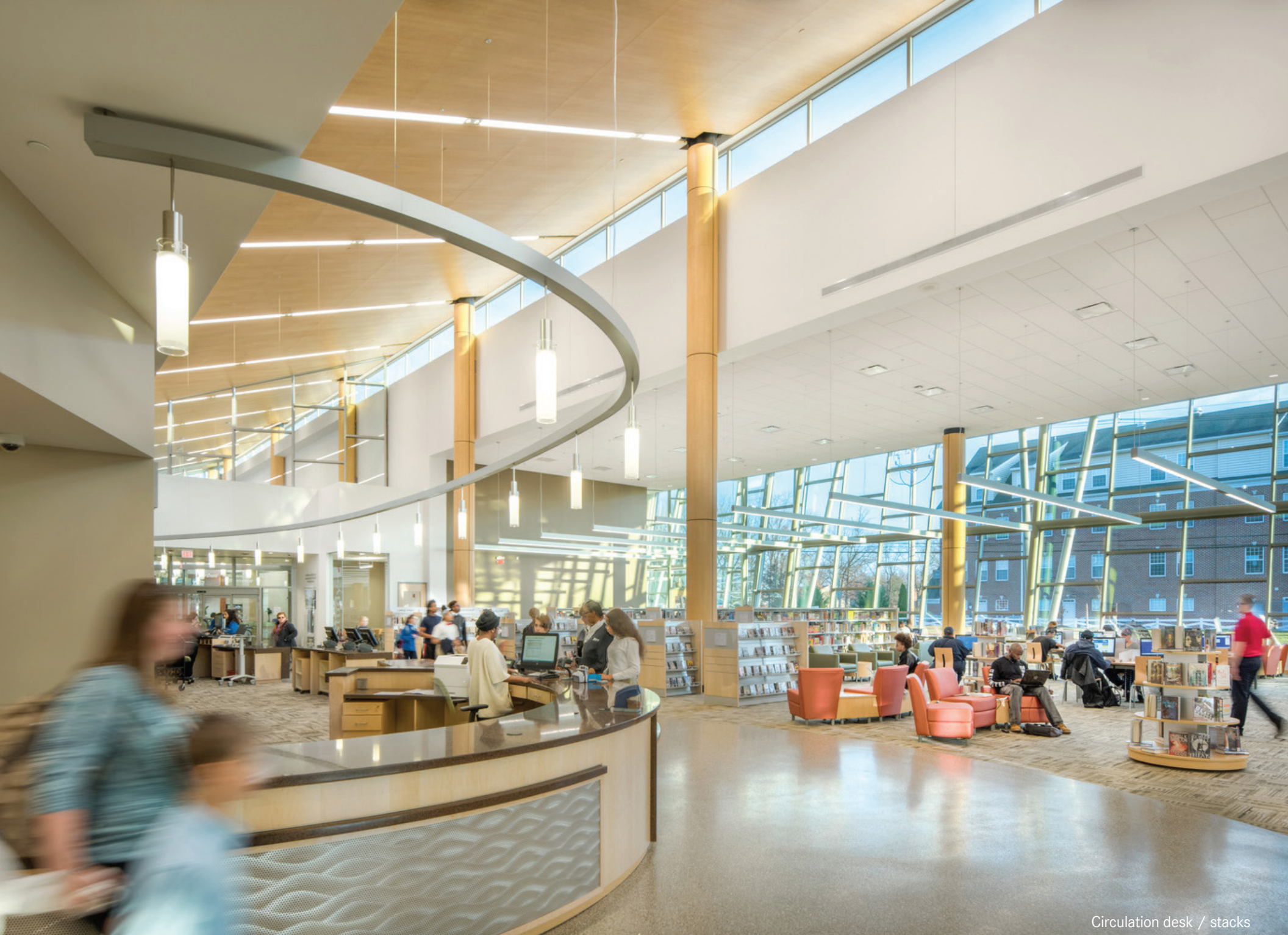
Circulation desk / stacks