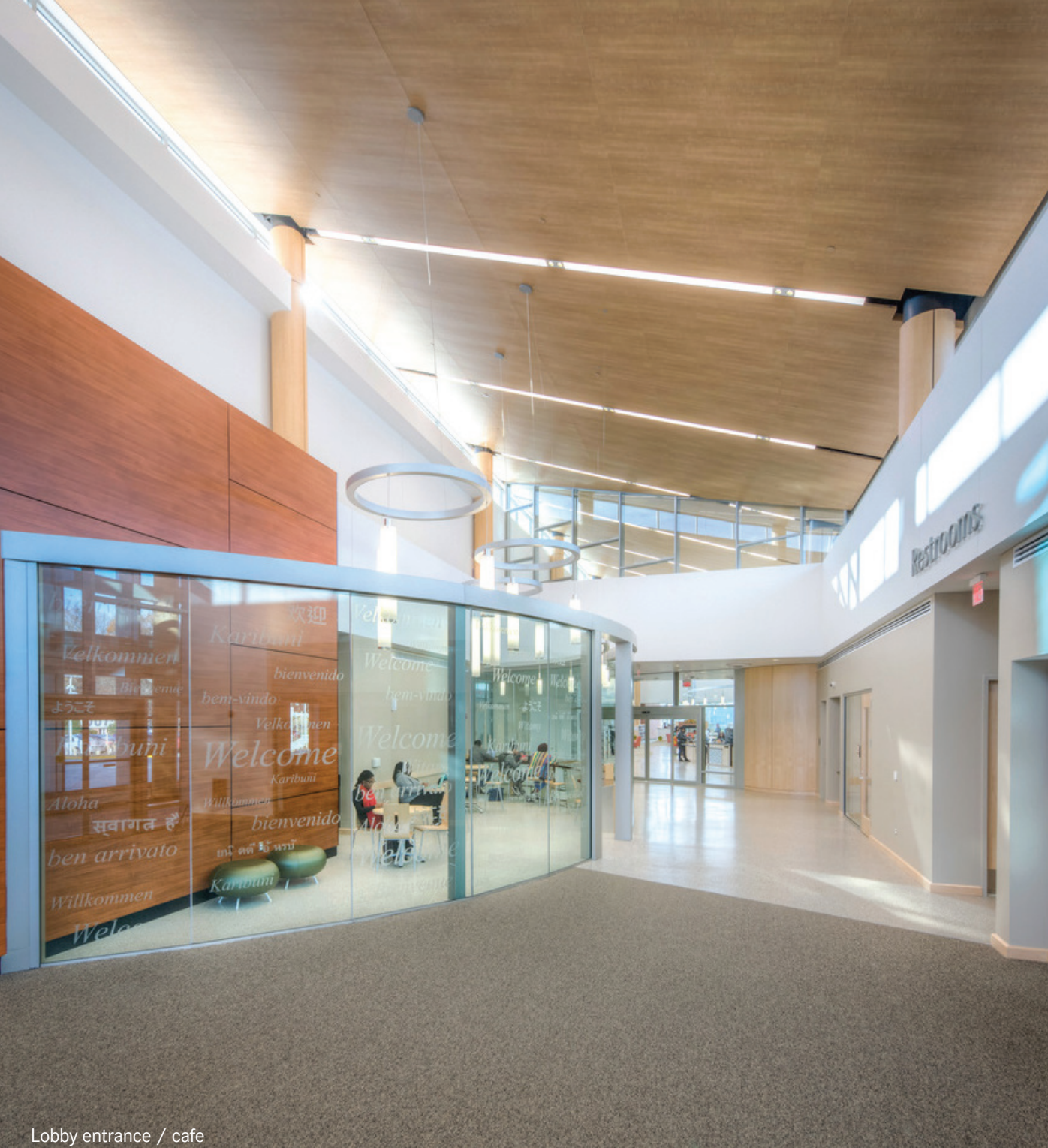
Lobby entrance / cafe

The design program philosophy for the new Laurel Branch Library aspired to create an environment that promotes learning, encourages social interaction and lifts the human spirit.