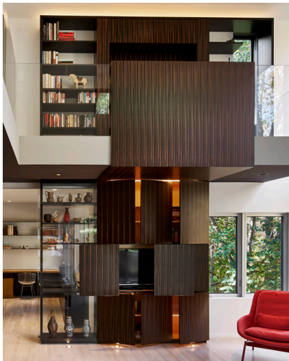
Media + Storage