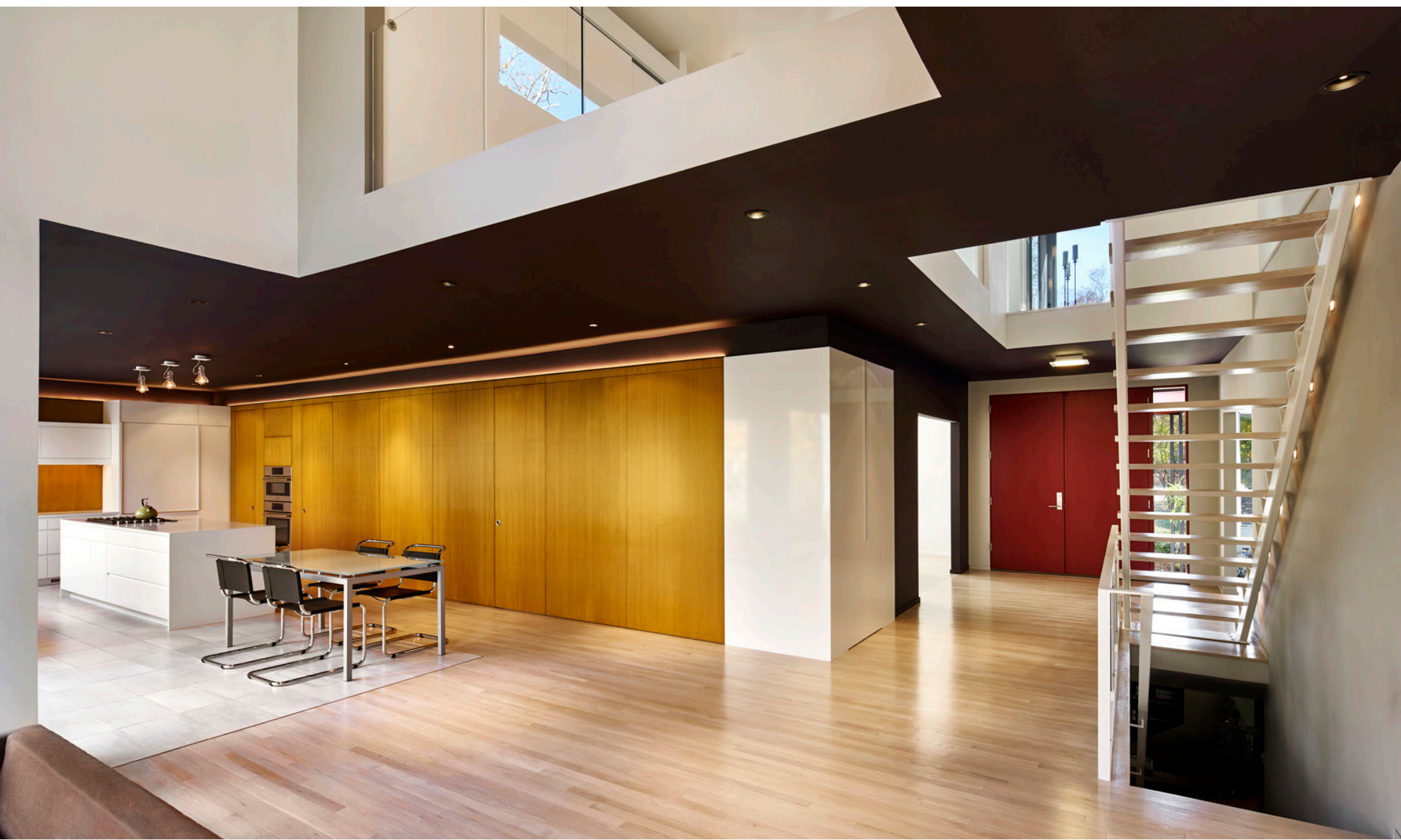
Main Living Space