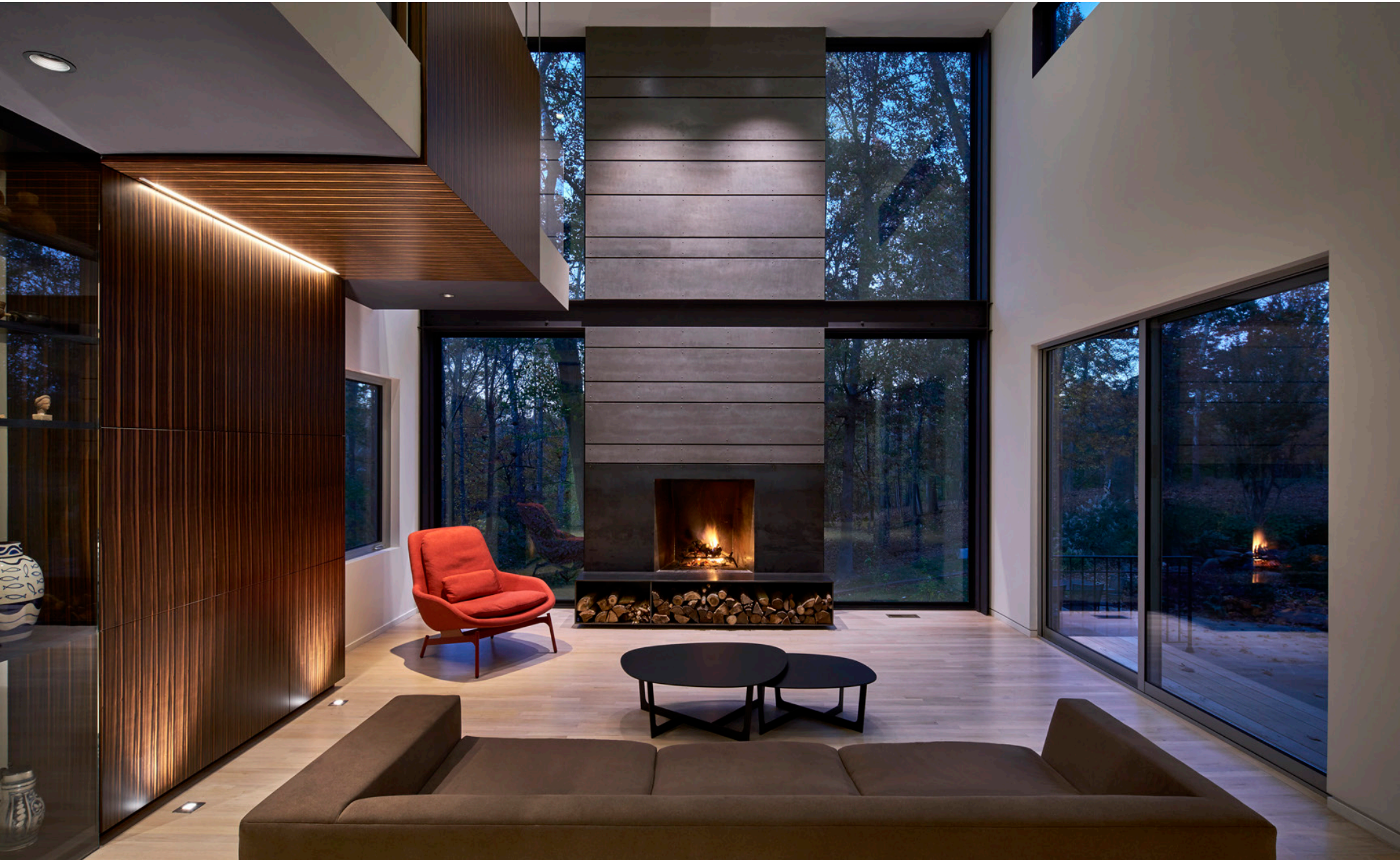
Main Living Space